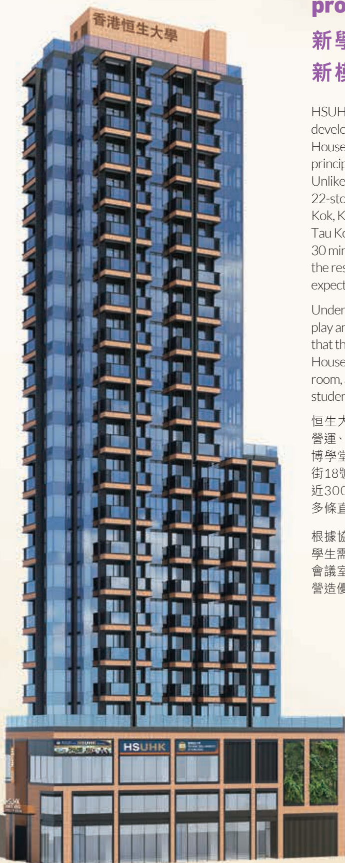
An artist's impression of the “HSUHK Erudite House” 「香港恒生大學博學堂」外觀構思圖

根據協議，大學擁有項目命名權並參與規劃設計，確保切合學生需要。「博學堂」設有健身室、舞蹈室、會議室、公共交流空間等設施，為學生營造優良的住宿及學習環境。