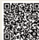
Biographies of the three Honorary University Fellows 三位榮譽大學院士簡介