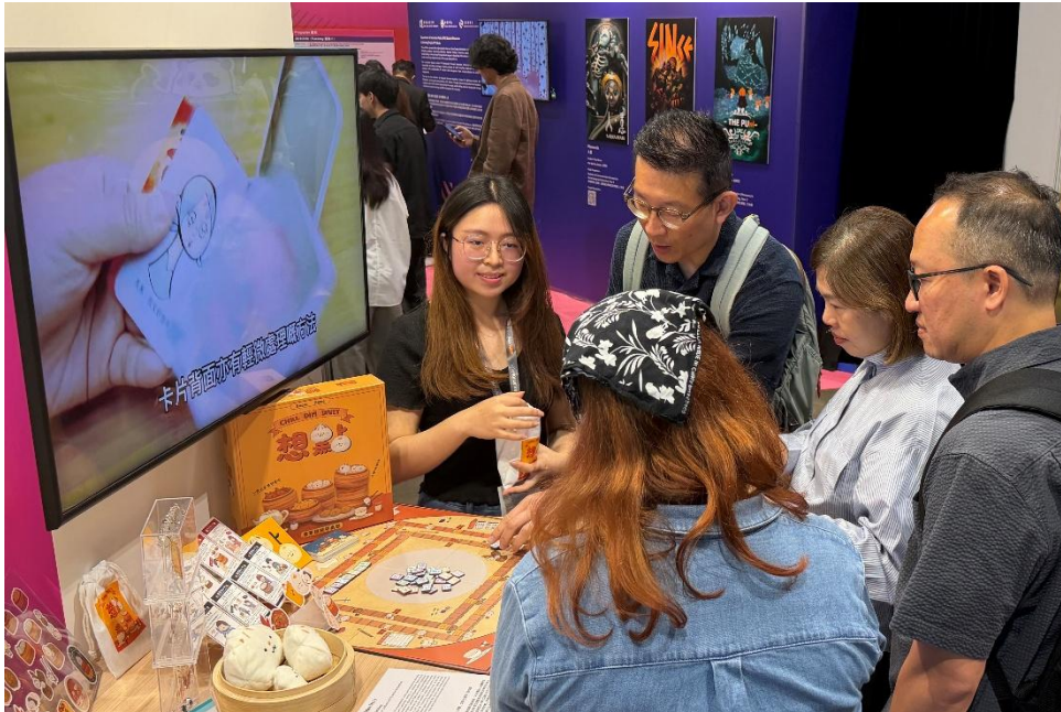
Photo 4: HSUHK students showcase their works at the Hong Kong International Licensing Show for the second consecutive year