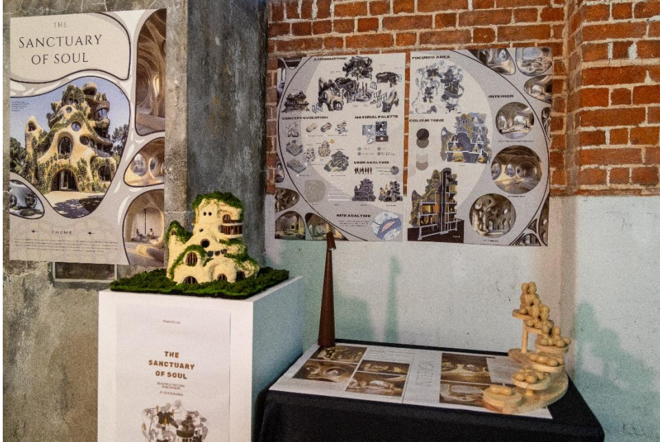
Photo 5: Sanctuary of the Soul , an architectural and landscape design project by Frances Lui, draws inspiration from the form of peanuts, using layered organic curves and irregular forms to break away from the box-like architecture commonly found in Hong Kong. The work also reflects the contrast between a hard exterior and a soft interior, expressing how urban dwellers may appear strong on the outside while inwardly needing space to rest and breathe, and envisions a tranquil environment free from rigid boundaries where individuals can return to themselves and engage in quiet reflection.

Photo 4: Monologue , a comic work by Ivan Leung, explores how people often use MBTI or other personality tests to categorise individuals and make sense of differences. However, the creator believes that each person is unique and cannot be fully defined or confined by such labels.