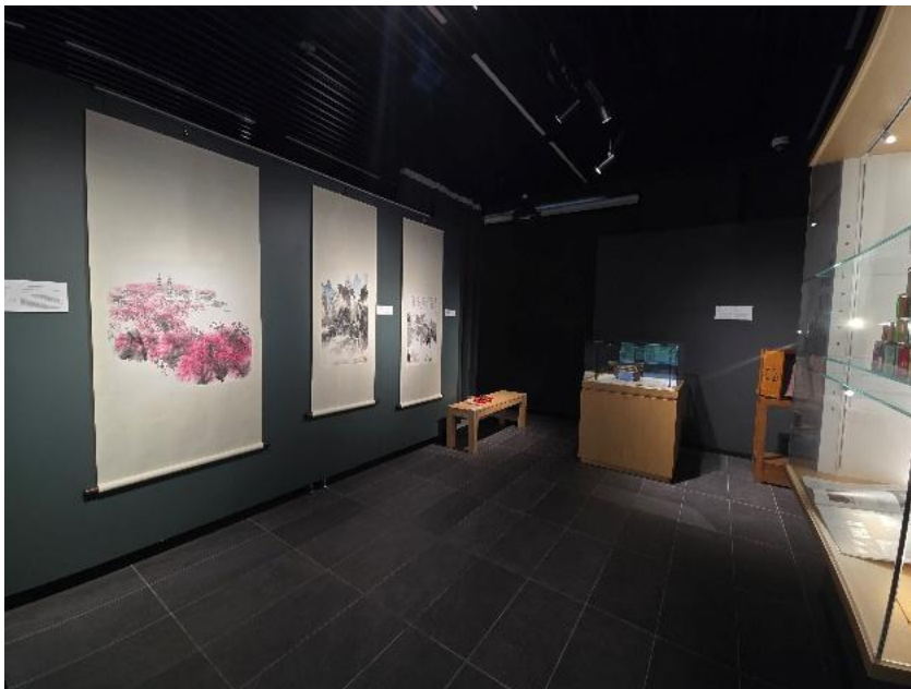
Photo 9: The HSUHK – Foundation Gallery. This exhibition bridges contemporary art with campus life, forging an organic connection between artistic practice, academia, and the art market.