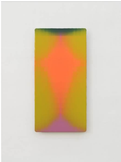
Photo 7: Through Wang Yi's meticulous overlapping techniques, he conveys emotional nuances concealed beneath rational geometric structure.