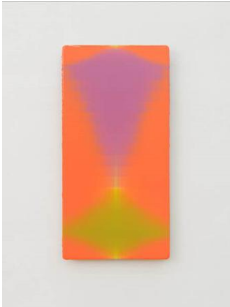
Photo 6: Wang Yi's Ksana series. Named after the Buddhist concept of an instantaneous moment, the artist challenges rigid industrial materials to evoke the fleeting sparkle of fireflies.

香港恒生大學 THE HANG SENG UNIVERSITY OF HONG KONG