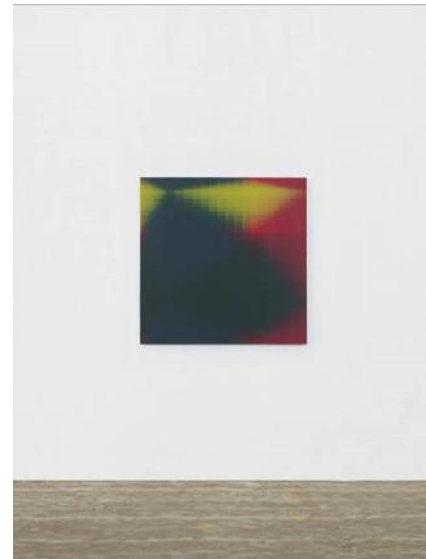
Photo 3 – 5: Wang Yi's representative work, Reflection of Shadow series. Acrylic on canvas or resin-coated aluminum panels, create visual depth through the layering of translucent colour blocks.