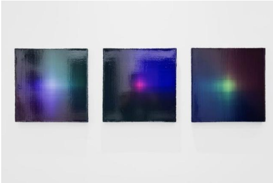
Photo 8: Immersive maze of reflective black glass and red bulbs. Visitors' reflections refract, overlap, and illuminate to heighten awareness of presence amid shifting lights and shadows.