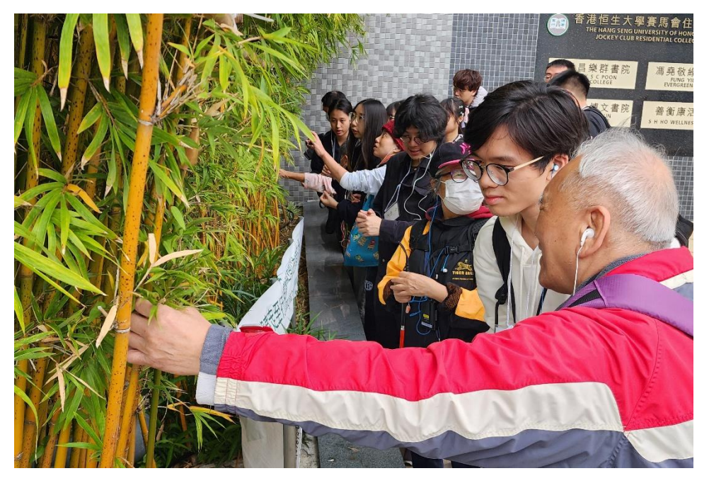
Photo 1: HSUHK students lead visually impaired individuals on a tour of the campus, where they learned more about bamboo, which is widely planted across campus.