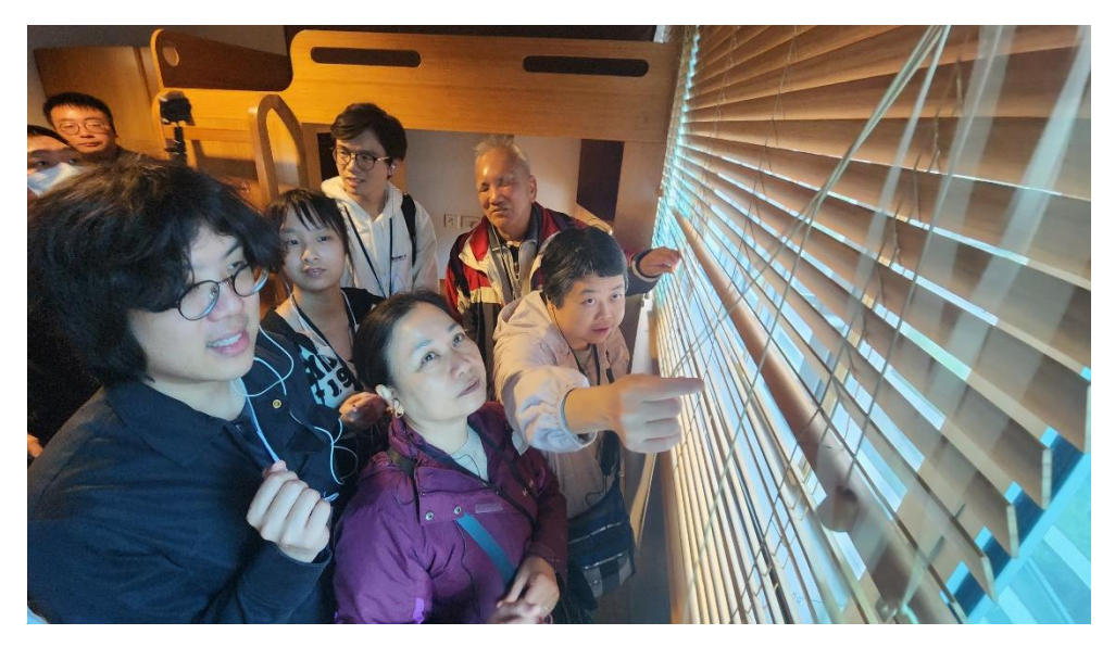
Photo 2: HSUHK students lead visually impaired individuals on a tour of the Residential Colleges, and experienced the difference between bamboo curtains and standard blinds with the sense of sound.

Photo 1: HSUHK students lead visually impaired individuals on a tour of the campus, where they learned more about bamboo, which is widely planted across campus.