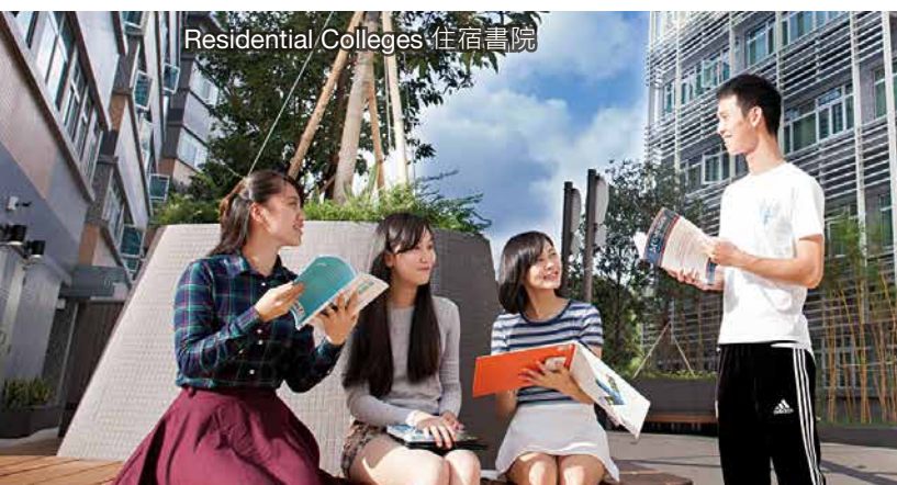
Residential Colleges 住宿書院