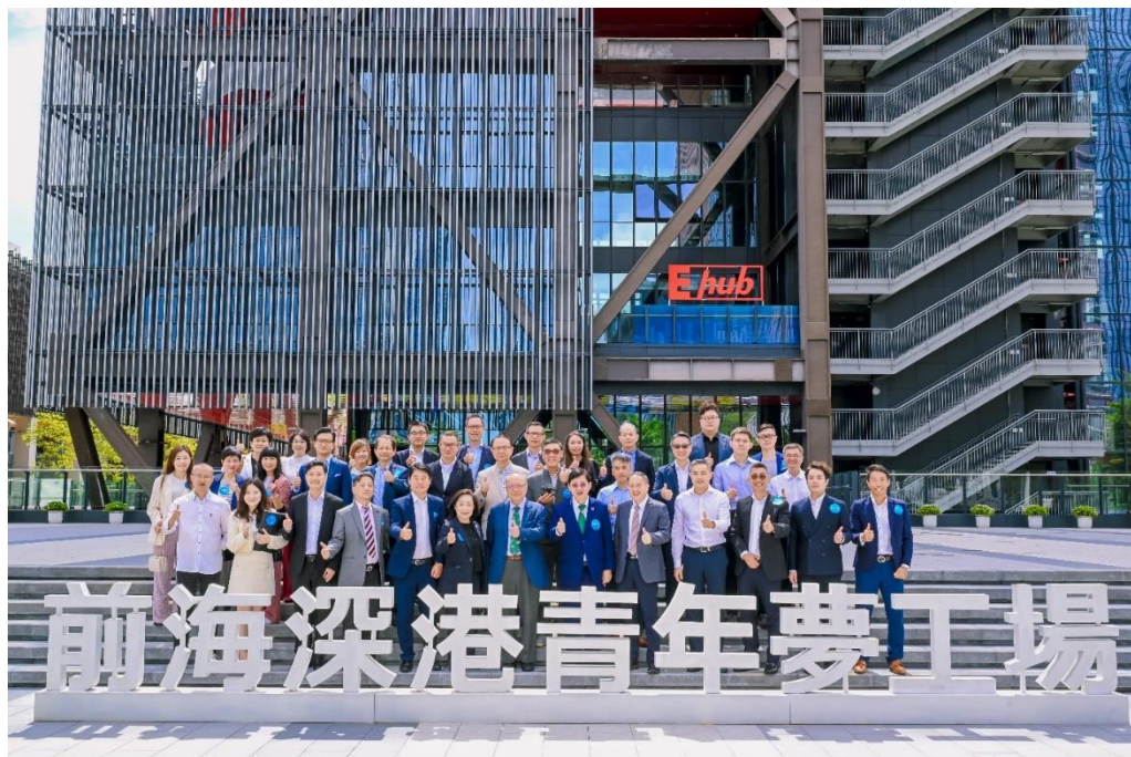
Photo 5: A delegation visits the “30 Financial Support Measures for Qianhai” exhibition and Qianhai Shenzhen-Hong Kong Youth Dream Factory.

香港恒生大學 THE HANG SENG UNIVERSITY OF HONG KONG