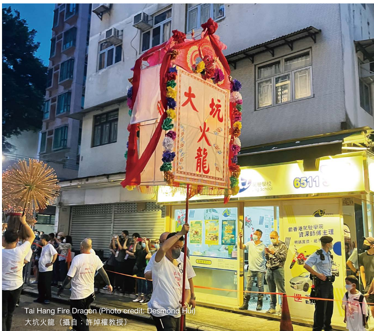
Tai Hang Fire Dragon 大坑火龍