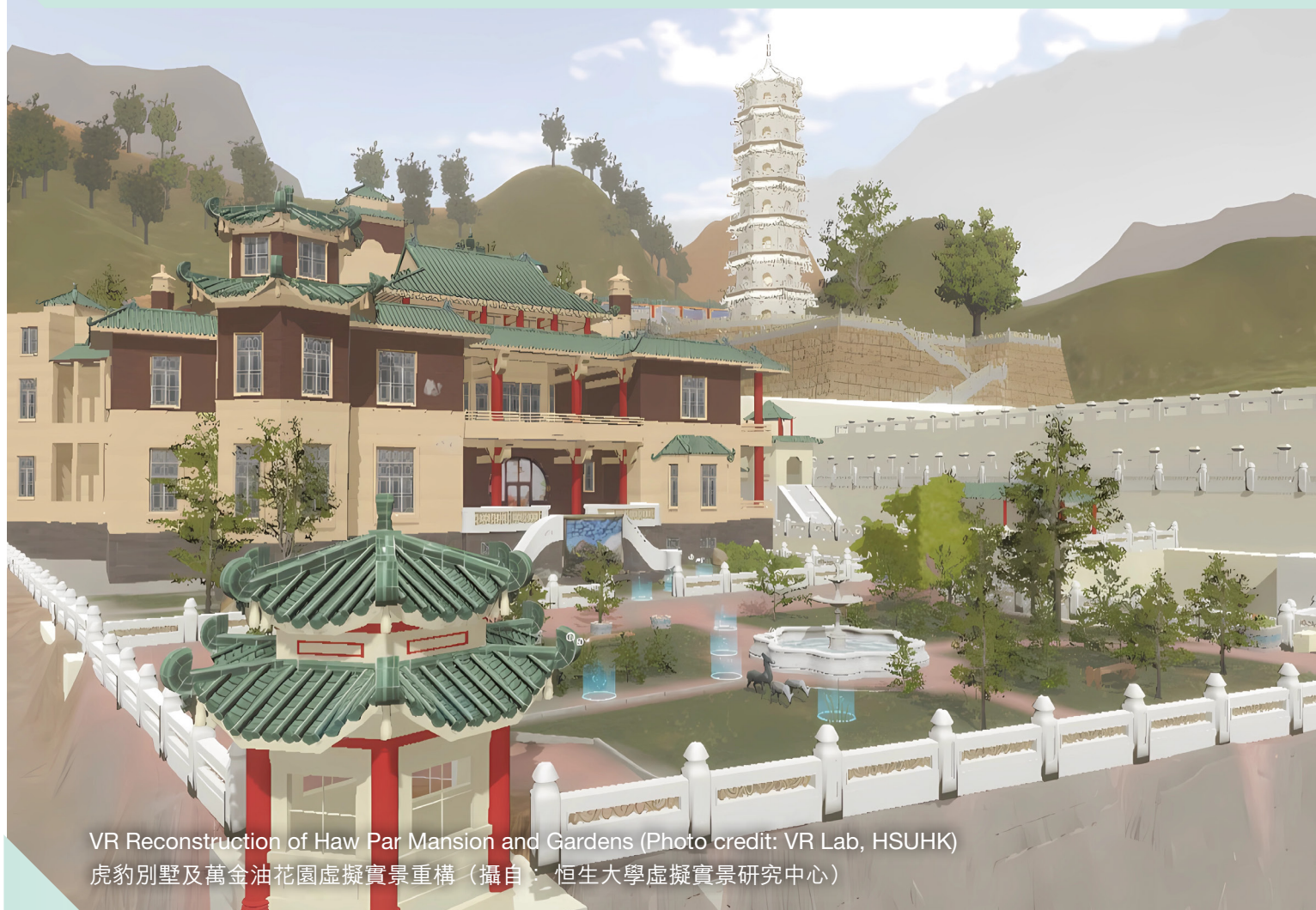
VR Reconstruction of Haw Par Mansion and Gardens 虎豹別墅及萬金油花園虛擬實景重構