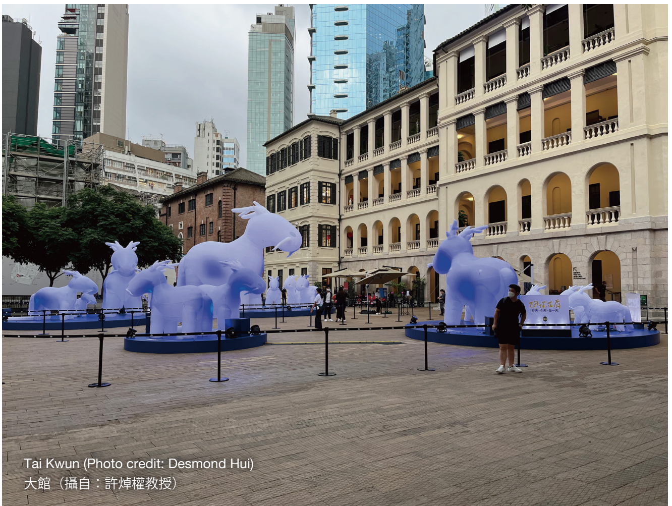
Tai Kwun 大館

本課程畢業生可繼續攻讀哲學碩士或博士課程，尤其適合以下範疇：藝術設計、人文歷史、文化研究、文化管理、建築、景觀建築、房地產、城市規劃、環境及可持續研究。