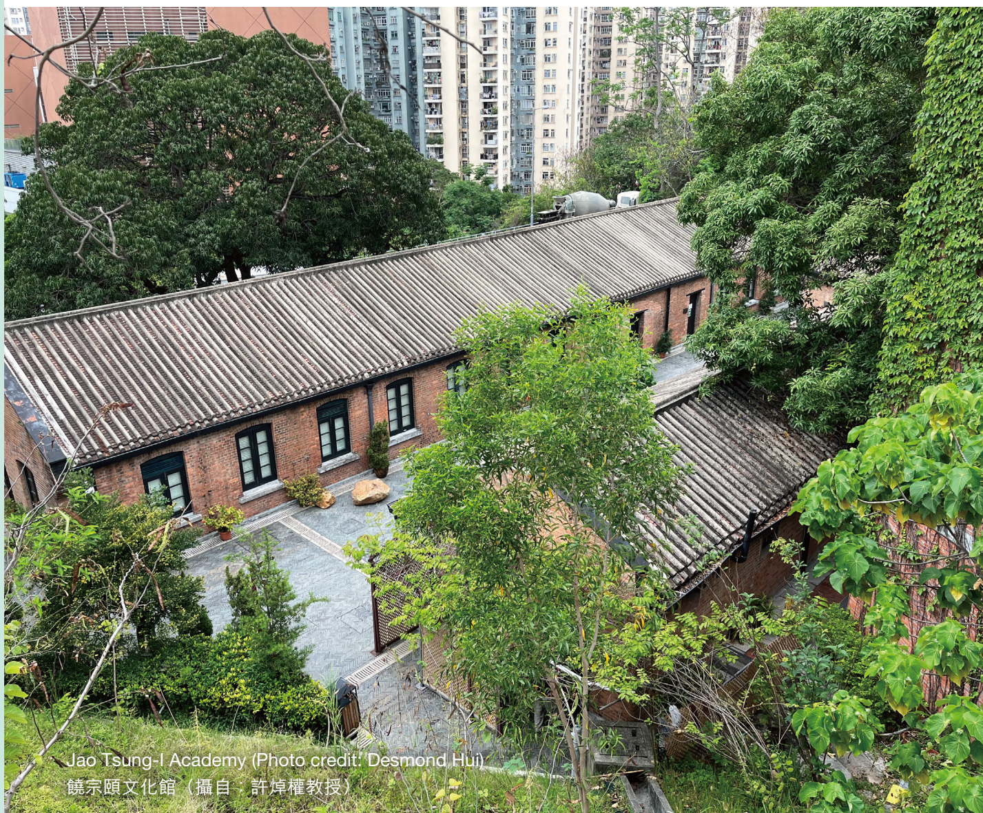
Jao Tsung-I Academy