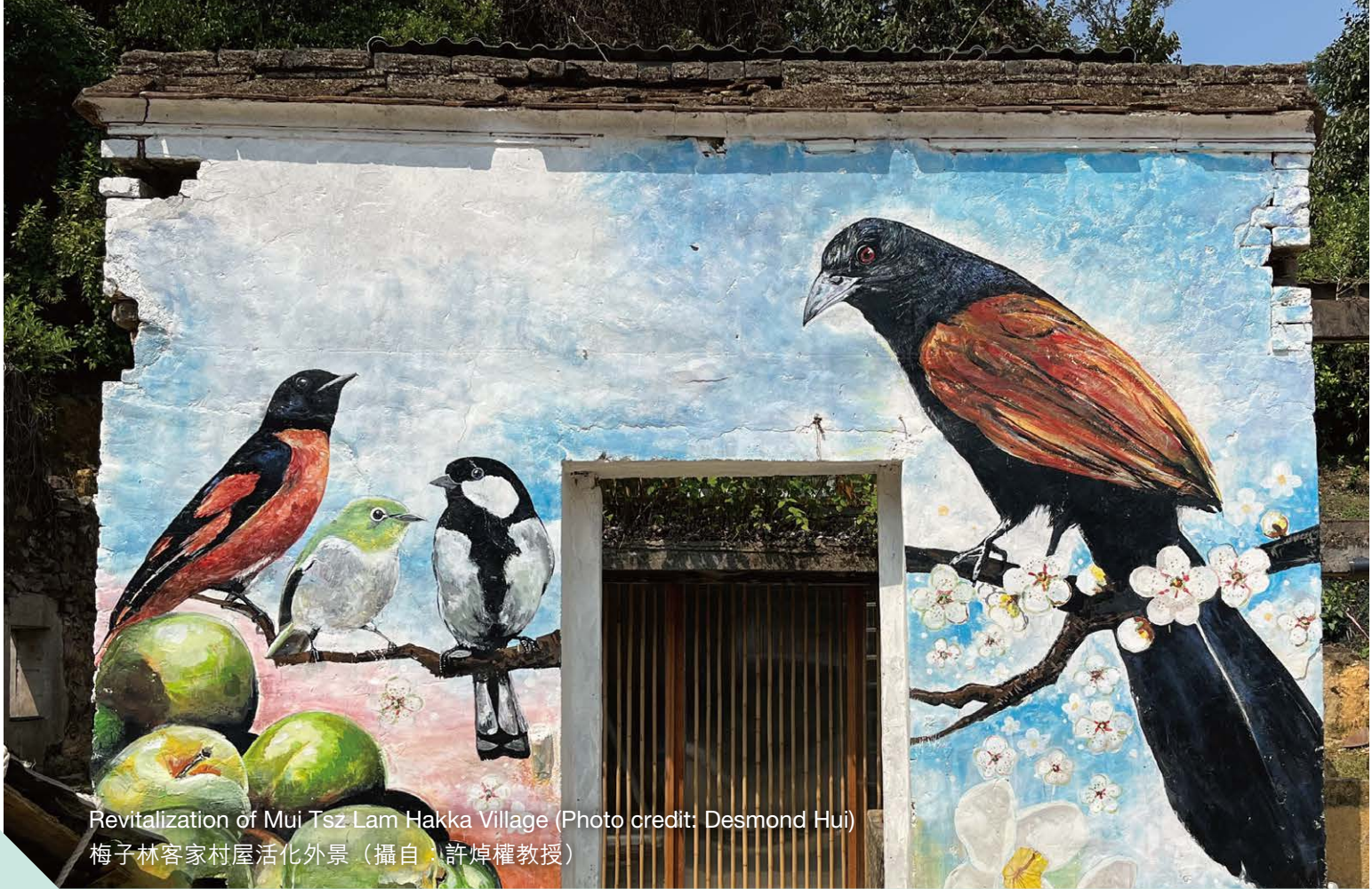
Revitalization of Mui Tsz Lam Hakka Village 梅子林客家村屋活化外景