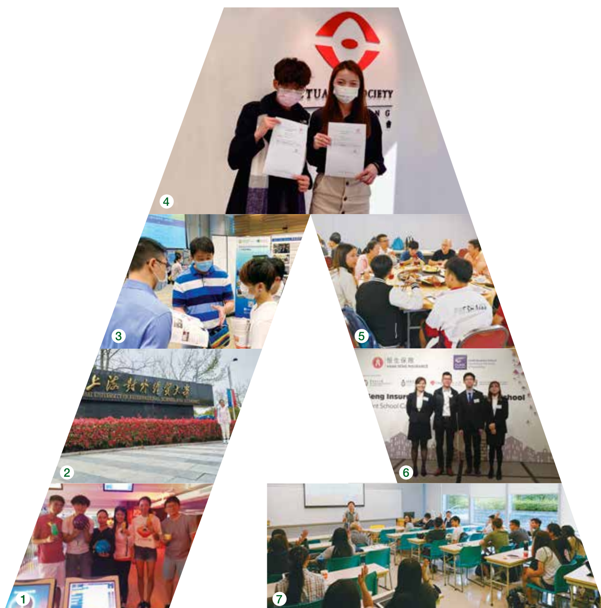
1 Mentorship Programme 師友計劃

為滿足市場對專業人才日益增長的需求，本課程獲納入教育局的指定專業/界別課程資助計劃。入讀本課程的本地學生，在課程的正常修業期內，每年可獲最高45,810港元學費資助。本資助計劃適用於一至三年級入讀之學生。