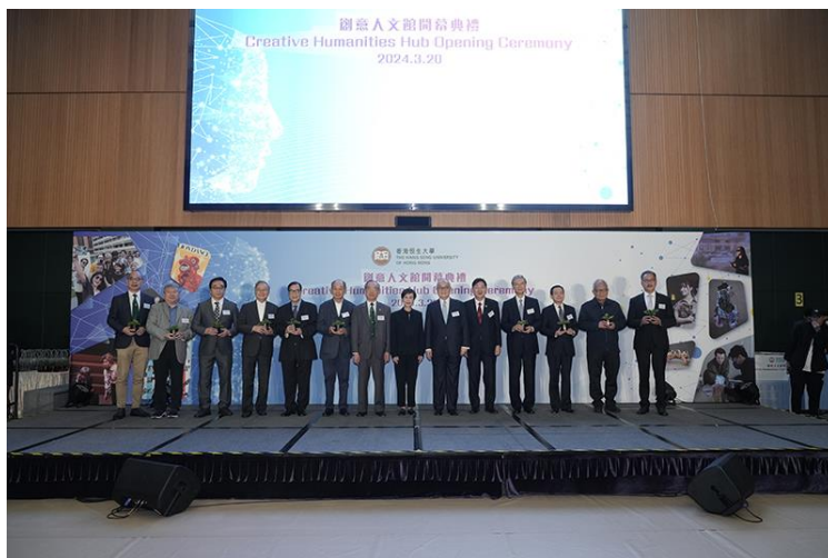
Photo 3 – 5: HSUHK management team expresses gratitude to donors and supporters at the opening ceremony of the Creative Humanities Hub.