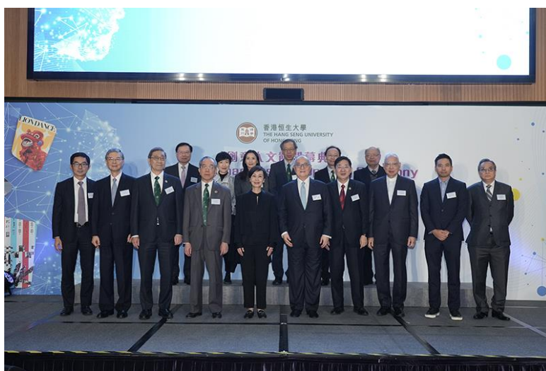
Photo 2: The Creative Humanities Hub officially opens, as witnessed by the University's management team.