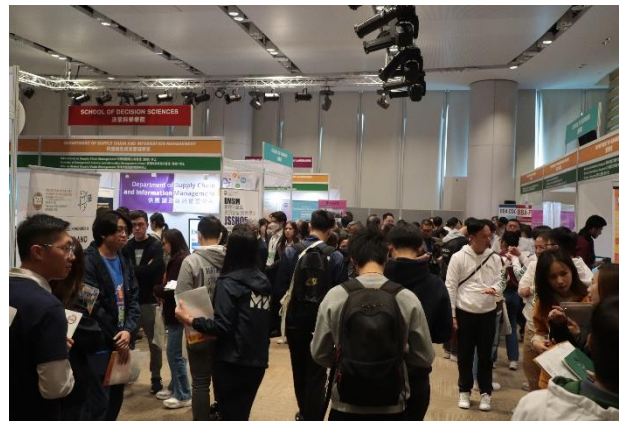
Photo 1 to 4: HSUHK Information Day draws numerous prospective secondary school students and their parents to learn more about HSUHK's latest programmes and admissions information.