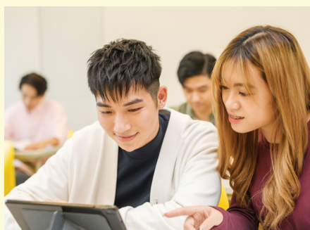
Independent research projects 獨立研究項目