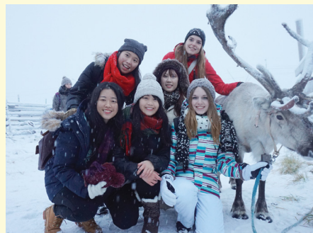
International exchanges 海外交流