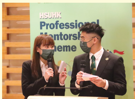
Mentorship programmes 師友計劃