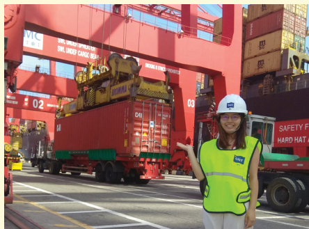
One student one internship 一學生一實習