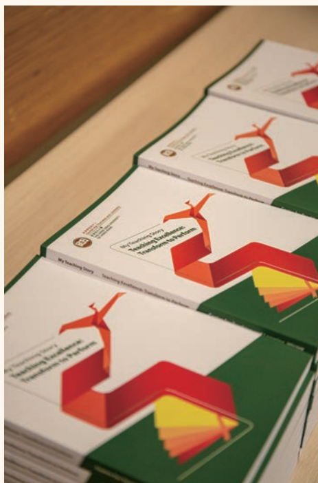
◀ Special Edition of My Teaching Story – Teaching Excellence: Transform to Perform published by CTL. 由教與學發展中心出版的《My Teaching Story – Teaching Excellence: Transform to Perform》。