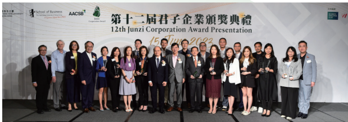
▲ Group photo of HSUHK senior management, honourable guests, and award winners. 恒生大學管理層、嘉賓及得獎企業合照。