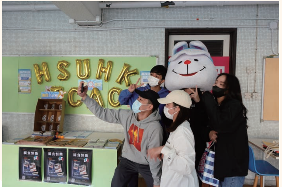
▲ Students take selfies with the ICAC mascot. 恒大廉政大使於校園設攤位，同學踴躍與廉政公署吉祥物「智多多」合照。

由學生事務處與廉政公署合辦的「廉政大使 2022-23」，於 2023 年 6 月 27 日舉行閉幕典禮。過去一年，「恒大廉政大使」於校園舉辦豐富多彩的活動，向師生及教職員推廣防貪知識及誠信校園。廉政公署代表讚揚恒大團隊熱心推動廉政活動，肯定同學過去一年的積極表現。