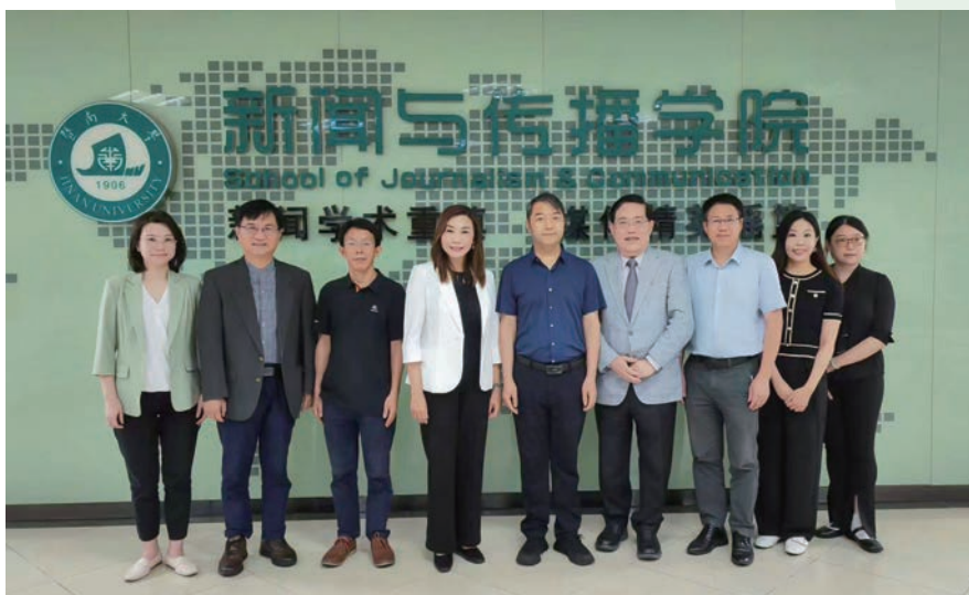
▲ Visit to the School of Journalism and Communication of JNU. 到訪暨南大學新聞與傳播學院。

期間，傳播學院分別與廣外新聞與傳播學院及暨大管理學院簽訂合作備忘錄，雙方同意在學術、研究、課程、交流互訪和人才培育等各方面，進行深度合作。