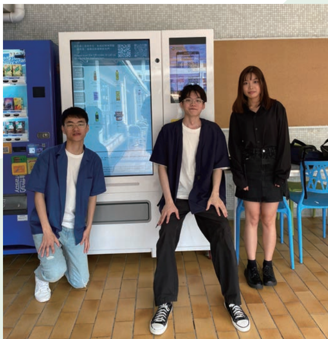
▲ Epads team with their service of vending machine. Epads 隊伍與他們的初創售賣機服務。

由五名恒生大學學生連同一名香港知專設計學院的畢業生組成的 Epads，成功在此計劃中通過 Gold Badge 階段，獲得五萬港元種子資金用作開發初創理念模型。他們的初創理念是利用售賣機來售賣女性專用用品，此售賣機亦曾擺放在恒大校園作兩個月試運，兼售食品及飲品，供教職員及學生使用。