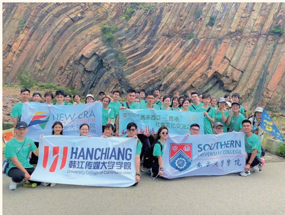
▲ A visit to Hong Kong Geopark. 同學參觀香港地質公園。

The 2023 Hong Kong – Malaysia Cultural Exchange programme, led by HSUHK and co-organised by three tertiary institutions in Malaysia, was held from 4 to 17 June 2023. A total of 22 HSUHK students and 24 Malaysian students attended the event which aimed to facilitate further cultural exchange between Hong Kong and Malaysia's youths. Through a variety of seminars, visits, and field trips across Hong Kong and Malaysia, students gained a deep and mutual understanding of the historical and cultural backgrounds of the two places.