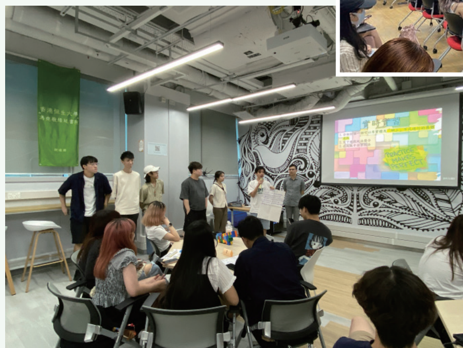
▲ Training workshop for Campus Life Mentors. 校園生活導師培訓工作坊。