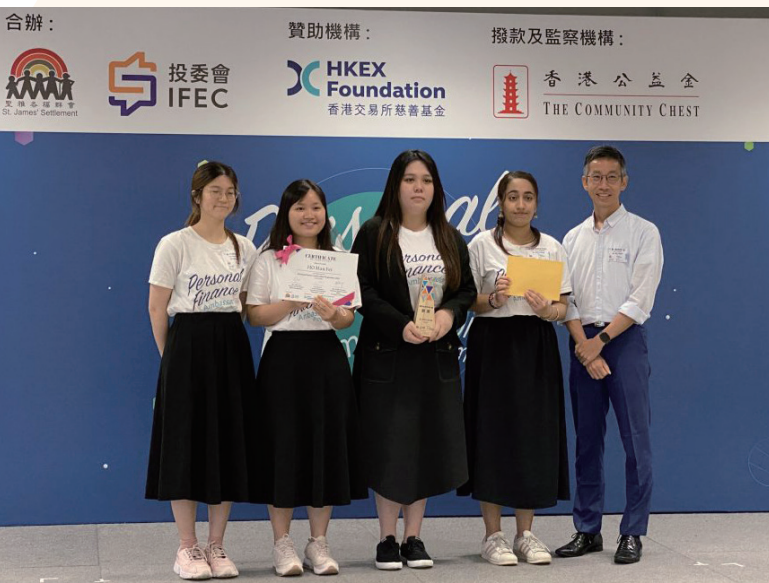
▲ Team from HSUHK wins Silver Award. 恒生大學銀獎隊伍。

由投資者及理財教育委員會和聖雅各福群會合辦的「個人理財大使計劃2023」，恒生大學學生組成的兩個隊伍，分別奪得銀獎和評審嘉許獎。15隊來自八所大專院校的參賽隊伍透過一系列訓練和活動，設計及推行理財教育計劃，向大眾推廣理財教育。