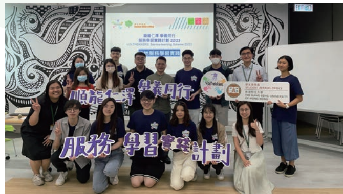
▲ Four service-learning teams share projects and learning outcomes with each other and tutors. 四隊服務學習隊伍完成本地服務計劃後，與同學和導師分享成果及得著。

學生事務處獲香港順龍仁澤基金會慷慨贊助，開展「順龍仁澤 學義同行」服務學習實踐計劃 2022-23，讓學生透過不同的本地及海外活動進行學習體驗。本年度計劃分為三個階段，包括舉辦與社會議題相關的培訓活動、設計切合服務對象需要的「本地服務實踐」，以及海外服務。為擴闊國際視野和提升社會服務技能，其中10位學生於2023年6月前往蒙古參與環境保護工作，並於當地學校為游牧民族兒童提供文化及環保意識的教育。