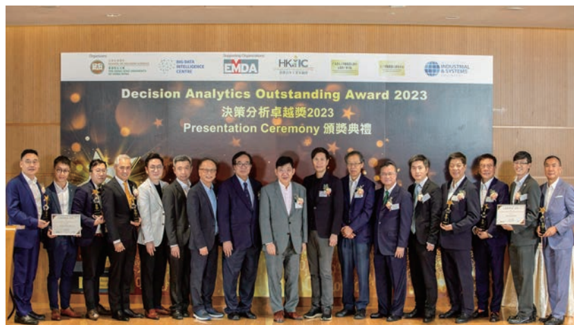
◀ Group photos of officiating guests and representatives of large enterprise awardees (left) and small and medium firm awardees (below). 主禮嘉賓與大企業得獎公司代表（左圖）及中小初創得獎公司代表（下圖）。

「決策分析卓越獎」鼓勵透過決策分析提升企業業務質素，從而發掘更多創新發展的機會。當中的決策分析技術包括雲計算、人工智能、大數據、物聯網、區塊鏈、虛擬現實等。該獎項分為四個類別，包括大企業的卓越商業分析和最佳實踐，以及中小企業的卓越創新理念和卓越數據執行。