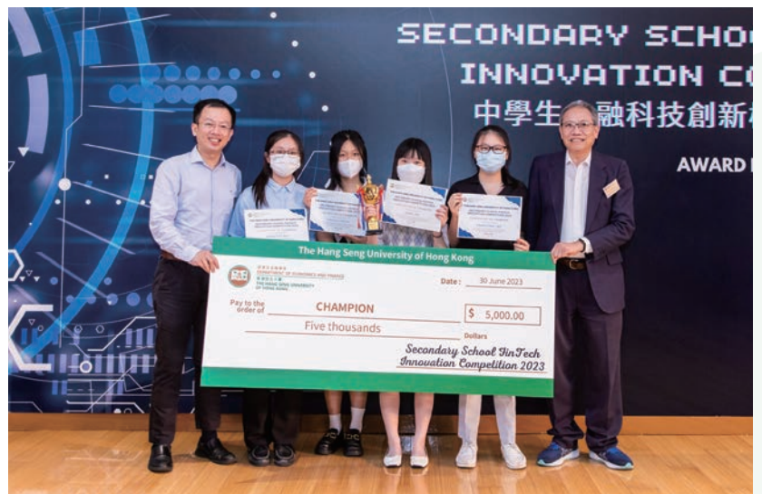
▲ St Paul's Secondary School is awarded Champion. 聖保祿中學奪得冠軍。

恒生大學經濟及金融學系近日舉辦中學生金融科技創新概念比賽 2023，以促進高中學生的金融科技知識，並鼓勵年青一輩勇於探索現今金融科技環境。冠軍由聖保祿中學奪得，小組成員設計了一款軟件，協助建立和管理短期共享資金賬戶，並配備匯率兌換功能，方便旅行時使用。軟件不但提供自動計算用戶間的共享資金，亦便利促進轉賬的過程，得到評判團一致嘉許。