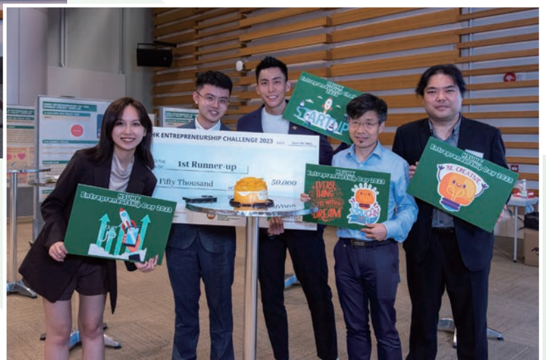
▲ The 1st Runner-up, team Wellbeing & Health in One, aims to create a medical assessment app on checking brain health under long COVID. 亞軍隊伍「Wellbeing & Health in One」開發醫學檢測應用程式，應對長新冠後遺症及腦健康。