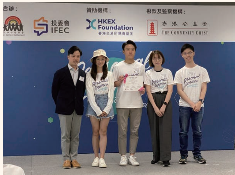
▲ Team from HSUHK wins the Judges Accredited Award. 另一支恒大隊獲得評審嘉許獎。