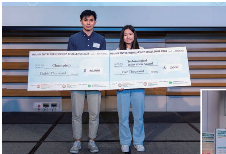
▲ The Champion, team Daoad, aims to create a circular economy by upcycling rice husks into high quality and sustainable products for promoting sustainability. 冠軍隊伍「稻可道」冀通過稻殼等農作物廢棄物的升級再造，為可持續發展作出貢獻。