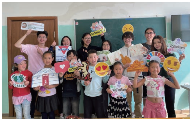
▲ Students work with nomadic children in Mongolia. 恒大大學生於蒙古一間學校為游牧民族兒童提供互動學習體驗。