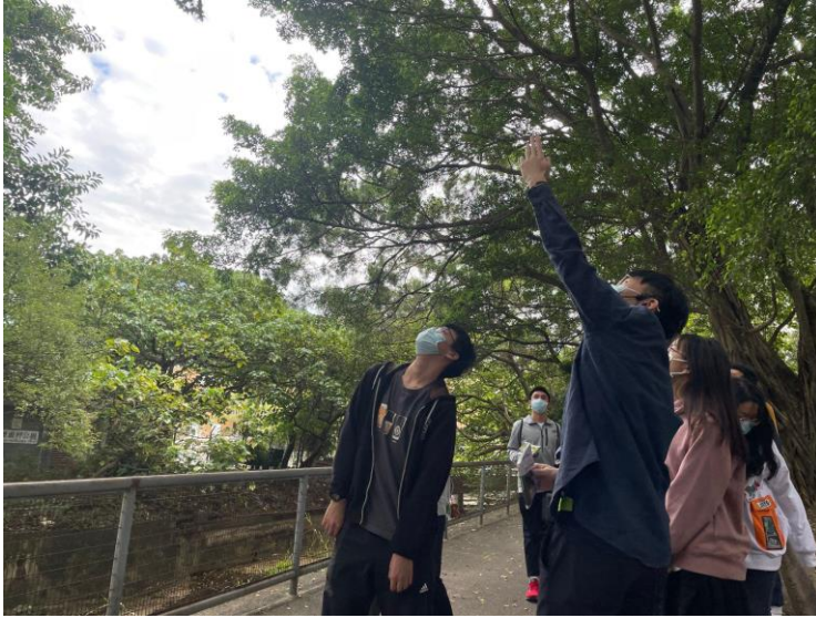
Student leaders of 'ECF Promoting Sustainability in Siu Lik Yuen' introduces the biodiversity in Siu Lik Yuen to HSUHK students in the eco-tour.