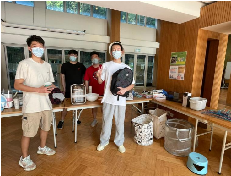
Residents donated their items in the Move-out Recycling Campaign