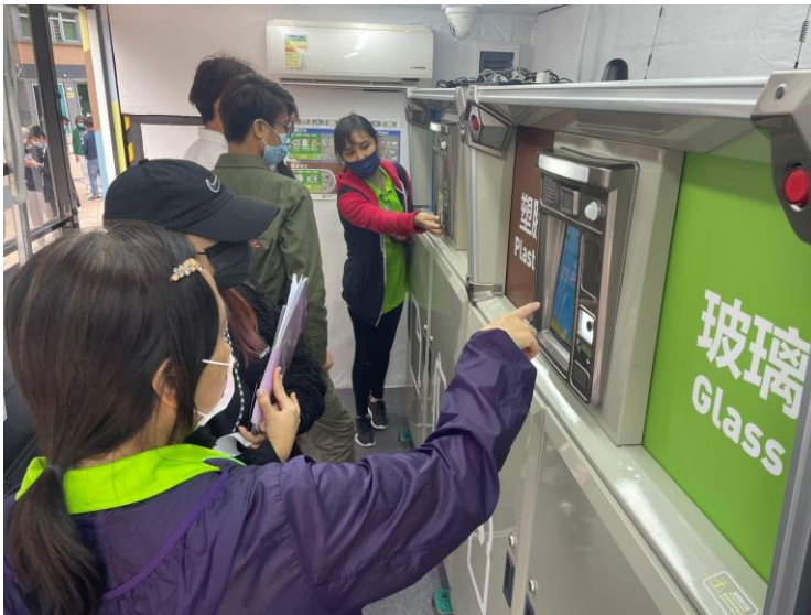
Participants understood more about the importance of clear recycling and smart recycling in the Living Green Sharing Evergreen activities.