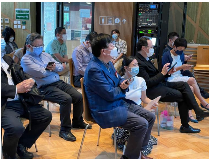
Student leaders of 'ECF Promoting Sustainability in Siu Lik Yuen' showcase the virtual tour they designed.