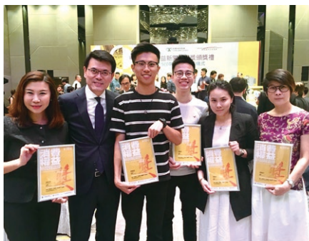
Students who were awarded in the 18th Consumer Rights Reporting Awards took photo with the Secretary for Commerce and Economic Development, Mr Edward Yau Tang Wah (2nd from left).

於第18屆消費權益新聞報道獎比賽獲獎的同學與商務及經濟發展局局長邱騰華先生(左二)合照。