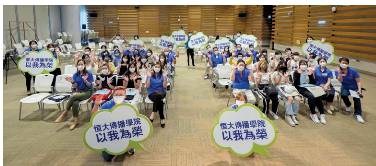
New Student Orientation 2022/23 of School of Communication 傳播學院新生迎新2022/23