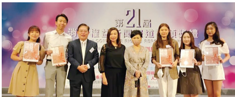
Students won the Bronze Award in the 21st Consumer Rights Reporting Awards. 同學於第21屆消費權益新聞報道獎比賽獲得銅獎。