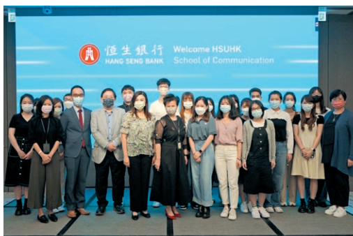
Teachers and Students visiting Hong Kong Hang Seng Bank Central Headquarters 傳播學院師生參訪香港恒生銀行中環總行