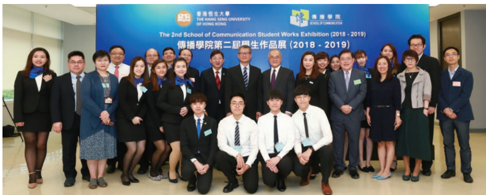
The 2nd School of Communication Students Works Exhibition 傳播學院第二屆學生作品展