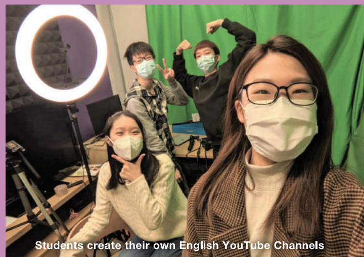
Students create their own English YouTube Channels