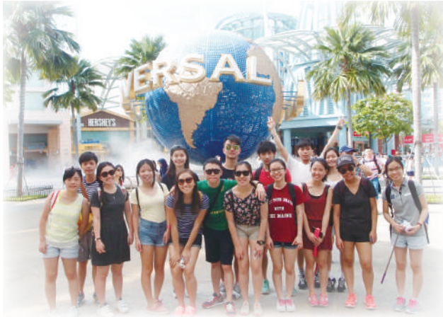
Summer breeze hits BA in English students in Singapore

The University offers exchange opportunities to students to increase their exposure in diverse cultures and cultivate their identity as global citizens. The Department also offers short-term summer exchange programmes and cultural tours around the world.