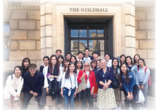
Students visit the UK to explore the historic city of London