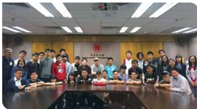
Census and Statistics Department 政府統計處