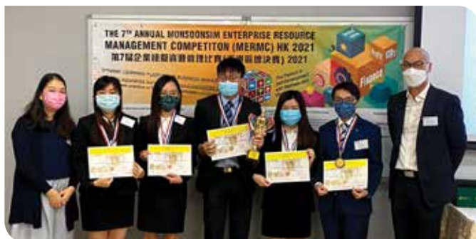
MonsoonSIM Enterprise Resource Management (Online Business Simulation Game) Hong Kong Competition 2021 – 2nd Runner Up