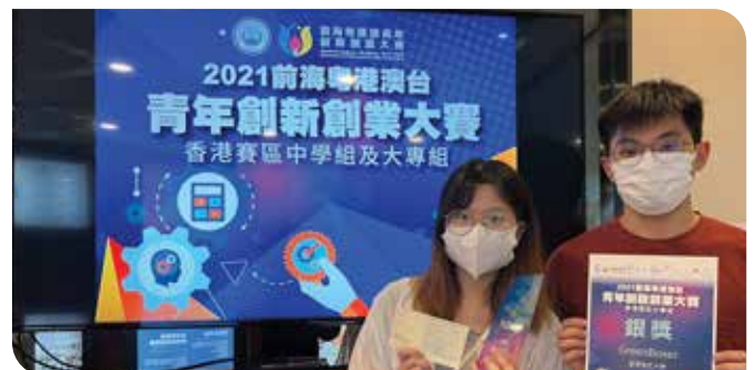
Qianhai Guangdong-Hong Kong-Macao Youth Innovation and Entrepreneurship Competition (Hong Kong Region, degree category) 2021 – Silver Prize