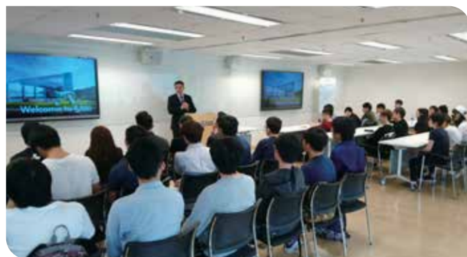
SAS Institute Inc