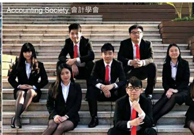
Accounting Society 會計學會