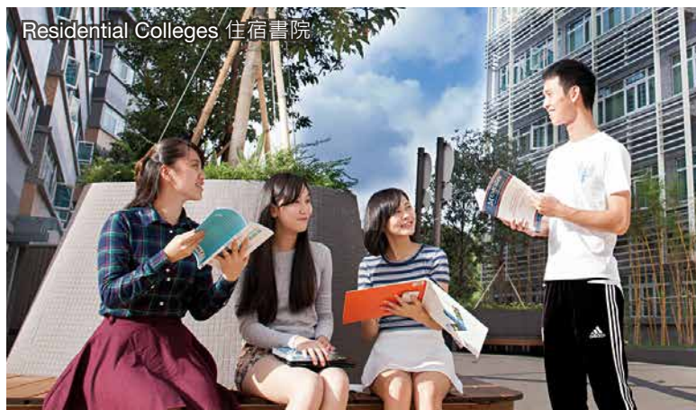
Residential Colleges 住宿書院

卓越教學是本校的傳統，更是本系的重點。教學團隊由擁有博士學位和持有會計、特許秘書及法律專業資格的老師組成。我們將多項課外活動納入學習歷程，包括邀請知名業內人士舉行客席講座、企業參觀、及鼓勵學生參加專業比賽。教學團隊與業界有良好的連繫，為學生提供實習和就業機會。我們亦重視學術研究，為課堂帶來前瞻知識。