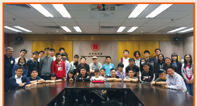
Census and Statistics Department 政府統計處