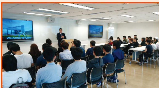
SAS Institute Inc