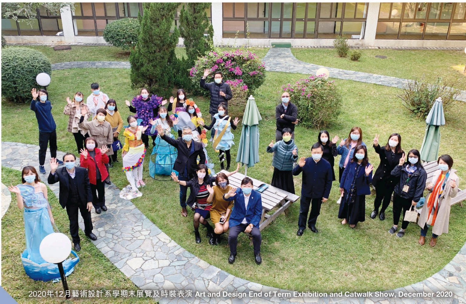
2020年12月藝術設計系學期末展覽及時裝表演 Art and Design End of Term Exhibition and Catwalk Show, December 2020