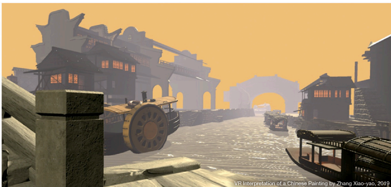
VR Interpretation of a Chinese Painting by Zhang Xiao-yao, 2019