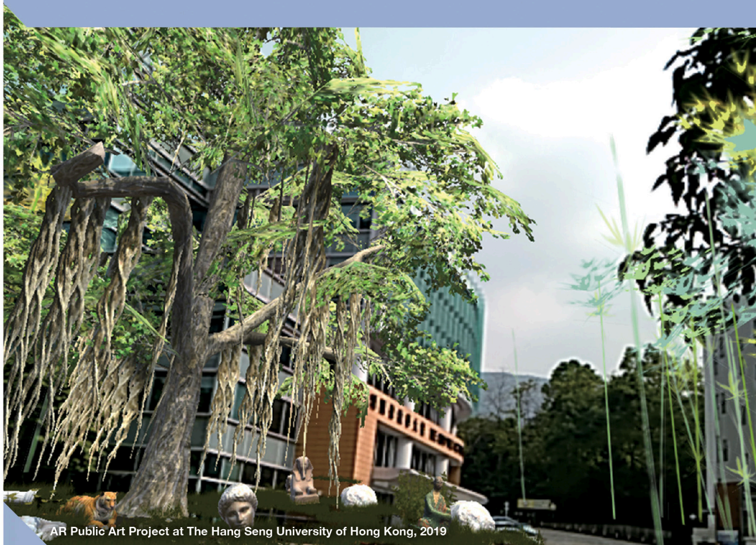
AR Public Art Project at The Hang Seng University of Hong Kong, 2019