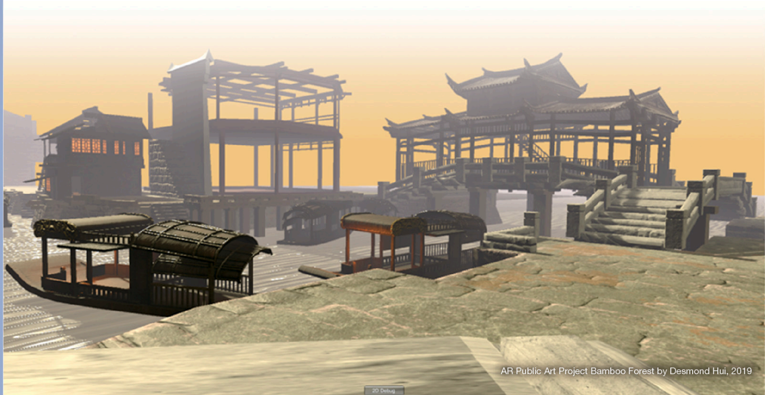
AR Public Art Project Bamboo Forest by Desmond Hui, 2019