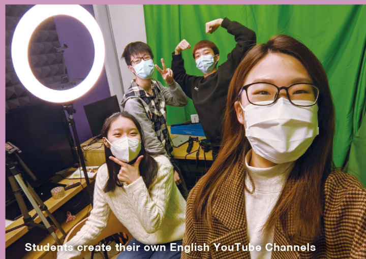
Students create their own English YouTube Channels