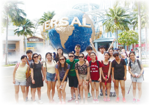
Summer breeze hits BA in English students in Singapore

The University offers exchange opportunities to students to increase their exposure in diverse cultures and cultivate their identity as global citizens. The Department also offers short-term summer exchange programmes and cultural tours around the world.