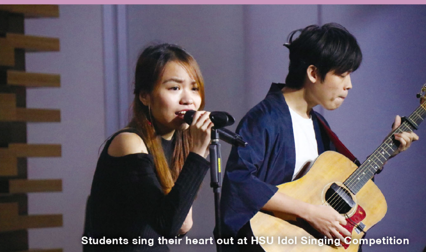
Students sing their heart out at HSU Idol Singing Competition

The English Language Centre (ELC) aims to help students enhance their English language skills. We provide tutoring services, English-language workshops, and cultural literacy activities, as well as a computer laboratory, a consultation/study room, and a variety of multimedia self-access materials. The workshops cover topics ranging from practical use of English to cultural lessons about various English-speaking societies. Additional activities include singing contests, reading groups, dramatic duologue competitions, movie nights, and seminars by guest speakers. Each of these opportunities allows students to brush up on their language proficiency and to broaden their cultural horizons.