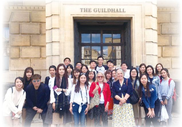
Students visit the UK to explore the historic city of London