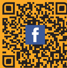
/HSU Marketing Community

T: 3963 5555 E: mkt@hsu.edu.hk (課程查詢Programme Enquiries) ugadmission@hsu.edu.hk (入學查詢Admission Enquiries) A: 新界沙田小瀝源行善里 Hang Shin Link, Siu Lek Yuen, Shatin, NT