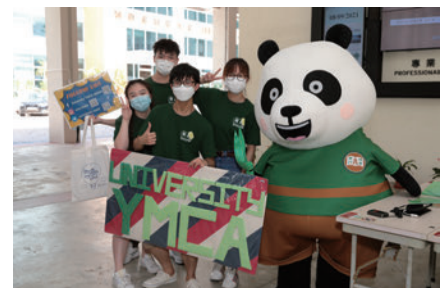
▲ Handa's moment! Take a pic! 「恒恒」出沒注意！不少同學蜂擁與它合照。