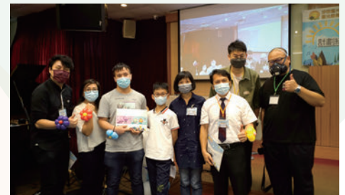
▲ HSUHK volunteers enjoy the 'Kwong Yuen Fun Day' with residents from the local community. 香港恒生大學義工與區內居民一同投入「廣源同樂日」。