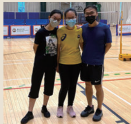
▲ Alumni enjoy sports fun with their friends and relatives. 校友與親友共享運動樂。

In July and August, AAAO offered the special experience 'Summer Feast and Sports Fun' to HSUHK Alumni as well. Alumni could enjoy dining privileges by presenting the HSUHK Alumni Card to designated hotels. Besides, they could pay a homecoming visit to indulge themselves at the University's sports facilities for free with their friends and relatives. Alumni spoke highly of the programme, which not only offered privileged dining experience and sports fun, but also helped promote a well-balanced lifestyle.