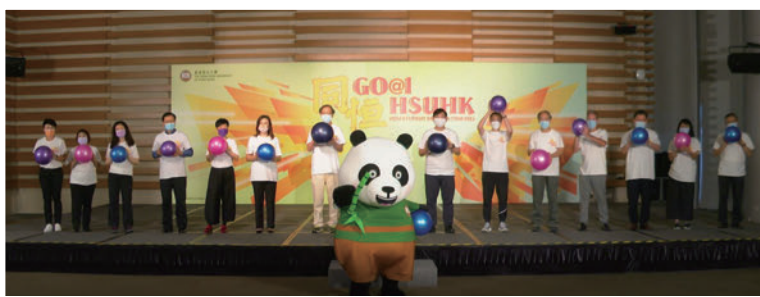
HSUHK New Student Orientation 2021 香港恒生大學迎新 2021