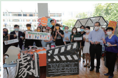
▲ Student organisations market themselves with recognisable setup. 各個學生組織花盡心思佈置攤位，傾巢而出宣傳。