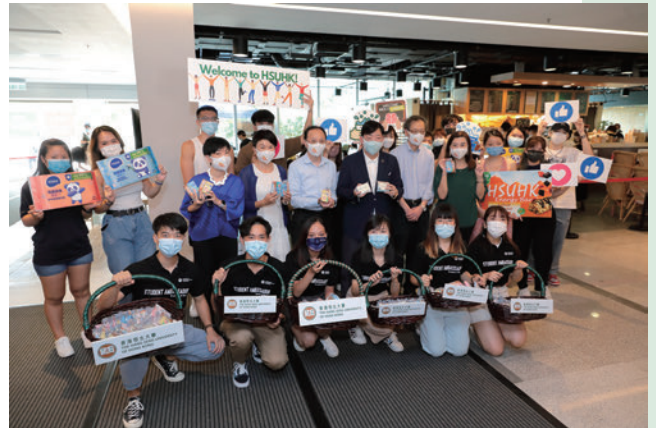
▲ Senior management spread cheer to teachers and students. 恒大管理層到校園四處向學生打氣。

大學不同部門及學生組織亦聯手舉辦活動，為校園加添活力和氣氛。其中香港恒生大學學生會舉辦「實體迎新活動宣傳展覽」，15 個學生組織設置攤位，讓同學即場報名入會及參加各項活動。學生事務處亦設攤位派發紀念品，不同學生團隊及文化小組也向同學介紹活動。