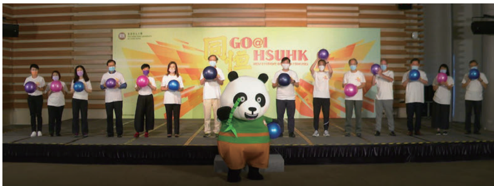
▲ Guests of Honour deliver their blessings and hopes to the new students through the balloons. 主禮嘉賓將對新生的寄望及祝福注入畢業球，送給新生。

Stepping into the new academic year, HSUHK held the New Student Orientation 2021 online on 17 and 30 August 2021 for senior-year new students and Year-1 students respectively. This year, with the theme 'Goal@HSUHK', over 2,000 students and staff participated in this flagship event. New students were able to acquire practical information from the event and get ready for the new semester!