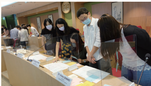
▲ Participants join a group activity during the OBTL workshop. 參加者參與「成果為本教學與標準參照評估」工作坊的分組活動。