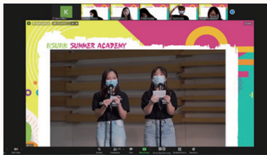
▲ The HSUHK Summer Academy 2021 is held successfully via Zoom. 香港恒生大學暑期體驗 2021 透過 Zoom 順利舉行。

The 5th HSUHK Summer Academy 2021 was held from 3 to 6 August 2021. A record-breaking number of participants joined this annual event which was conducted online for the first time. Over 200 local Secondary 5 and Secondary 6 students attended a wide array of activities hosted via Zoom; they tasted university life in person, discovered their interests and explored future paths through demo lectures, online games, group discussion and workshops. Certificates were presented to the participants on the completion of designated online events and online evaluation form as a token of appreciation for their active participation.