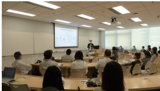
▲ Participants learn about different kinds of learning platforms. 參加者認識不同學習平台。

於第二天啟導課程，大會為新教學人員舉行了「建立友善、正面、高成效的學習環境」論壇、「成果為本教學與標準參照評估」工作坊和「認識課程評審及質素保證」講座。而為增強新教職員對各行政部門的認識，今年新增設由人力資源主管楊美蘭女士主持的「恒大行政及支援部門概覽」講座。參加者都非常踴躍，積極與高層管理人員作出討論。