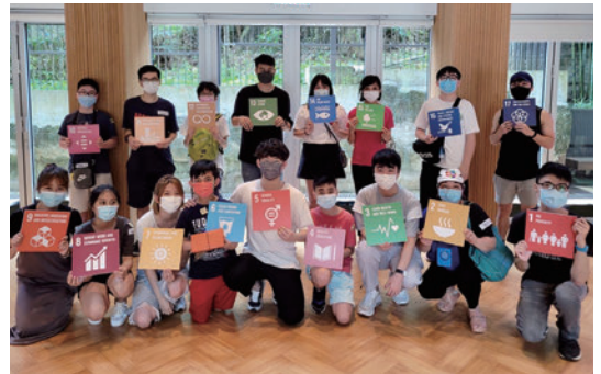
▲ IYSL volunteers introduce the 17 Sustainability Development Goals (SDGs) to the participating primary school students. IYSL 義工向參與小學生介紹 17 個可持續發展目標。

而在2021年6月5日，IYSL 與沙田靈光教會靈光睦鄰中心合辦了「廣源同樂日」。活動當日，30多名香港恒生大學學生義工於攤位遊戲及展板問答遊戲中提供協助；大會亦設立了「幸福照相館」，由香港恒生大學義工為家長及小朋友在不同地區的場景中拍攝家庭照留念。