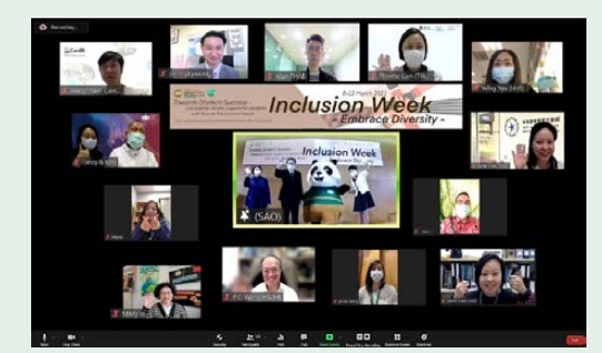
▲ The first online Kick-off Ceremony of the Inclusion Week connects HSUHK students, staff and external collaborators via the online platform Zoom. 首屆共融週啟動禮於網上舉行,並透過 Zoom 平台 連繫恒大學生、教職員及校外協作伙伴。