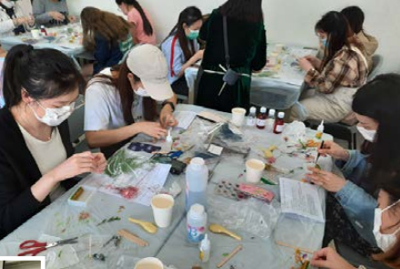
▲ Epoxy Resin Miniature Scene Decoration Workshop 水晶滴膠微縮場境擺設工作坊

handicraft booths such as a Henna painting booth were also available. Cheer-up messages in different languages including Chinese, English and Japanese were shared with students as well, wishing them good luck in examinations.