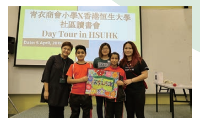
▲ IYSL organises a Chinese learning project in a primary school to help ethnic minority students learn Chinese. IYSL 於小學舉辦伴讀計劃以幫助少數 族裔學生學習中文。