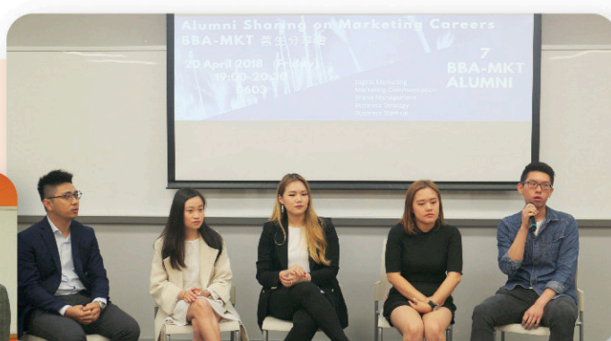
Alumni Sharing 校友分享