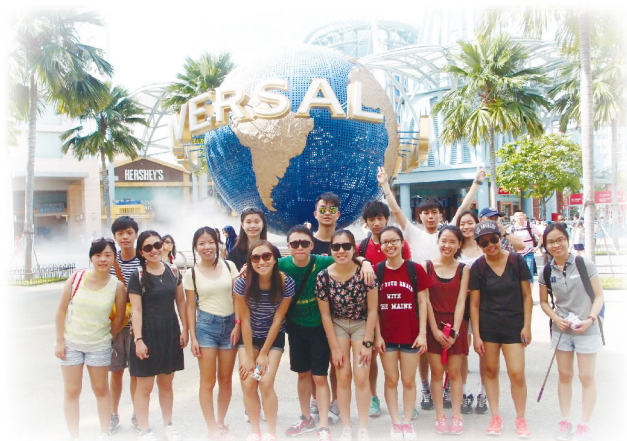
Summer breeze hits BA in English students in Singapore

The University offers exchange opportunities to students to increase their exposure in diverse cultures and cultivate their identity as global citizens. The Department also offers short-term summer exchange programmes and cultural tours around the world.