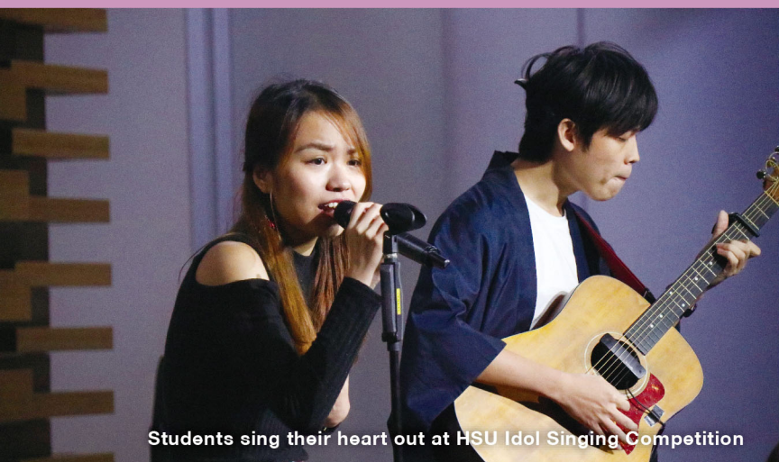
Students sing their heart out at HSU Idol Singing Competition

The English Language Centre (ELC) aims to help students enhance their English language skills. We provide tutoring services, English-language workshops, and cultural literacy activities, as well as a computer laboratory, a consultation/study room, and a variety of multimedia self-access materials. The workshops cover topics ranging from practical use of English to cultural lessons about various English-speaking societies. Additional activities include singing contests, reading groups, dramatic duologue competitions, movie nights, and seminars by guest speakers. Each of these opportunities allows students to brush up on their language proficiency and to broaden their cultural horizons.