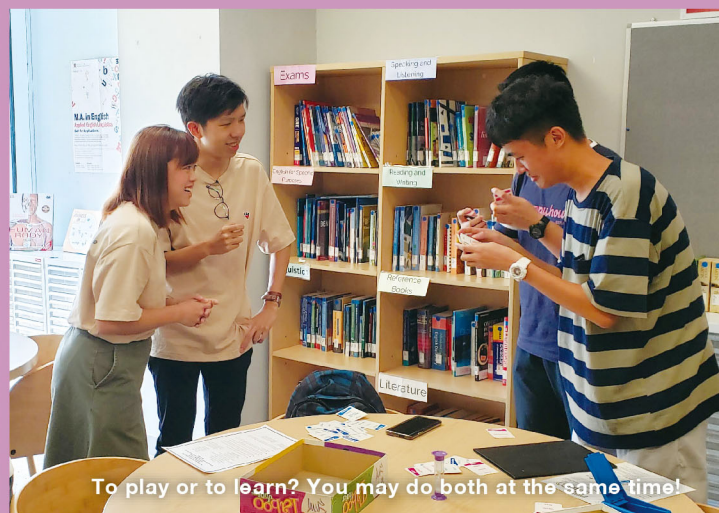
To play or to learn? You may do both at the same time!