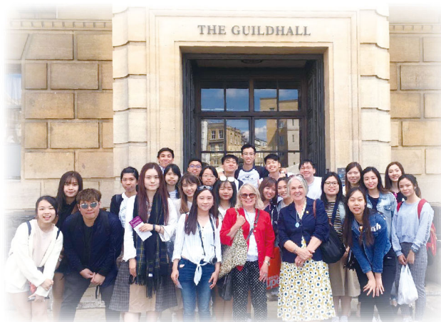
Students visit the UK to explore the historic city of London