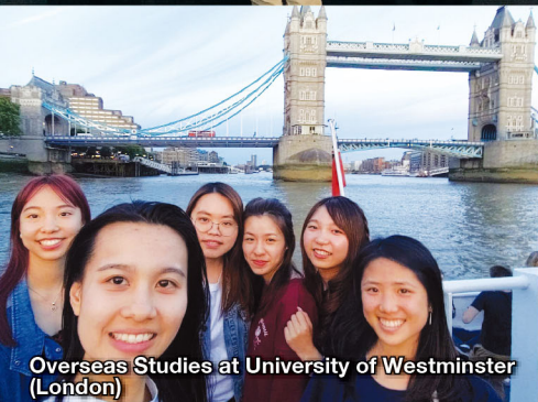
Overseas Studies at University of Westminster (London)