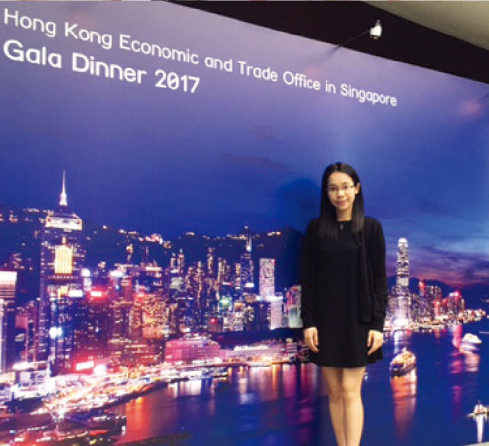
Internship Programme at Hong Kong Economic and Trade Office, Singapore