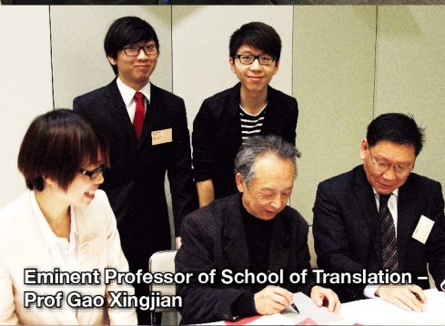
Eminent Professor of School of Translation – Prof Gao Xingjian