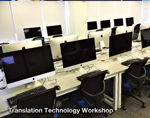
Translation Technology Workshop