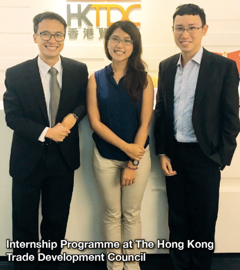
Internship Programme at The Hong Kong Trade Development Council