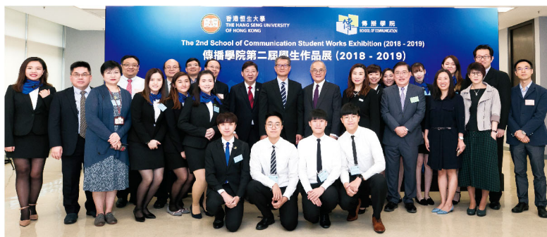
Group photo of the 2nd School of Communication Student Works Exhibition (2018/19) 傳播學院第二屆學生作品展 (2018/19)大合照