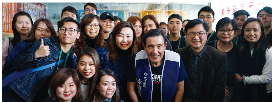
SCOM teachers and students took photo with Taiwan Former President Ma Ying-jeou in the 2020 Taiwan Election Study Tour. 傳播學院師生於2020年台灣總統副總統及立法委員選舉考察團中與台灣前總統馬英九先生合照。