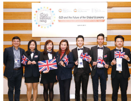
Students participated in the G20 2019. 同學參與G20模擬峰會2019。