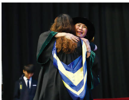
Graduates took photo with the Dean of School of Communication at the graduation ceremony. 畢業生與傳播學院院長於畢業禮合照。