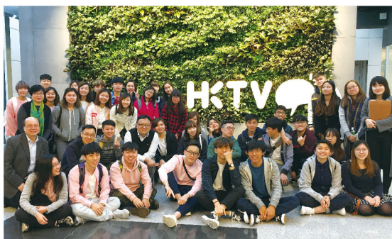
Students visited HKTVMall Media Production Centre. 學生參觀香港電視HKTVMall媒體製作中心。