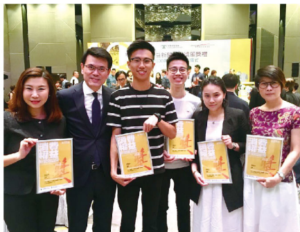
Students who were awarded in the 18th Consumer Rights Reporting Awards took photo with the Secretary for Commerce and Economic Development, Mr Edward Yau Tang Wah (2nd from left). 於第18屆消費權益新聞報道獎比賽獲獎的同學與商務及經濟發展局局長邱騰華先生(左二)合照。