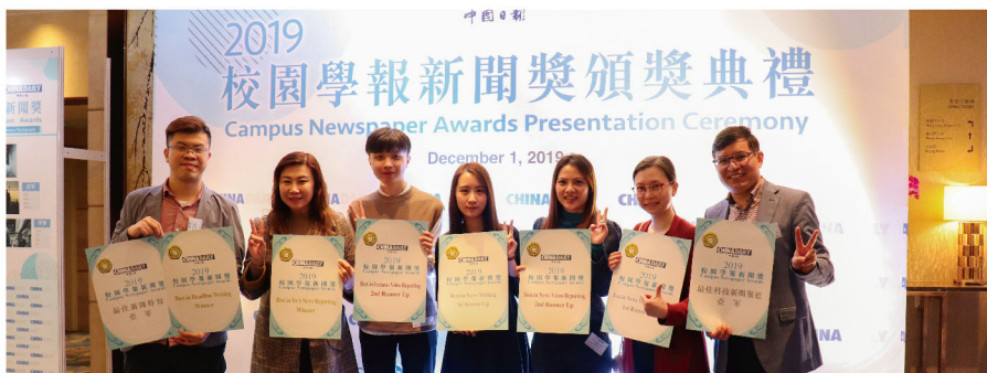
Students were awarded in the Campus Newspaper Competition. 同學於校園學報比賽獲得多個大獎。