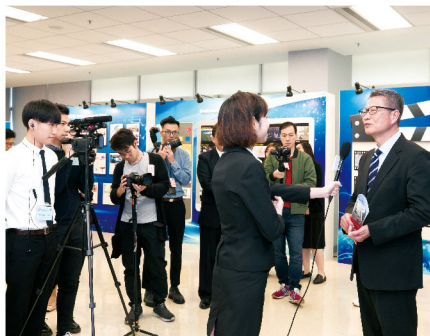
Mr Chan Mo Po, the Financial Secretary of HKSAR, was interviewed by BJC students in the 2nd School of Communication Student Works Exhibition (2018/19). 陳茂波財政司司長於傳播學院第二屆學生作品展(2018/19)接受傳播學院的同學訪問。