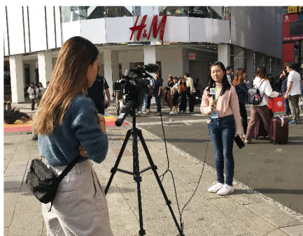
Students conducting interviews in Taipei 學生於台北街頭進行採訪。