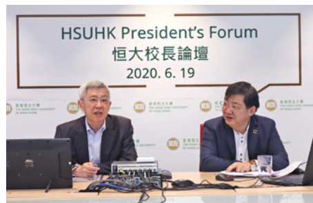
HSUHK President's Forum