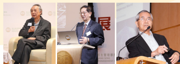
Distinguished Lecture Series by Nobel Laureates (From left) Dr Gao Xingjian (Literature), Professor Yuan-Tseh Lee (Chemistry) and Professor Ei-ichi Negishi (Chemistry)