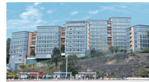
HSUHK Jockey Club Residential Colleges