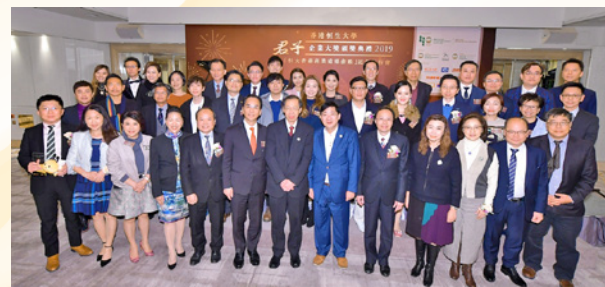
Annual Junzi Corporation Project cum HSUHK Hong Kong Business Ethics Index