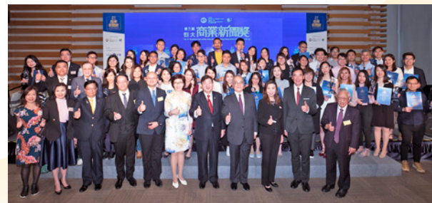
Annual HSUHK Business Journalism Awards