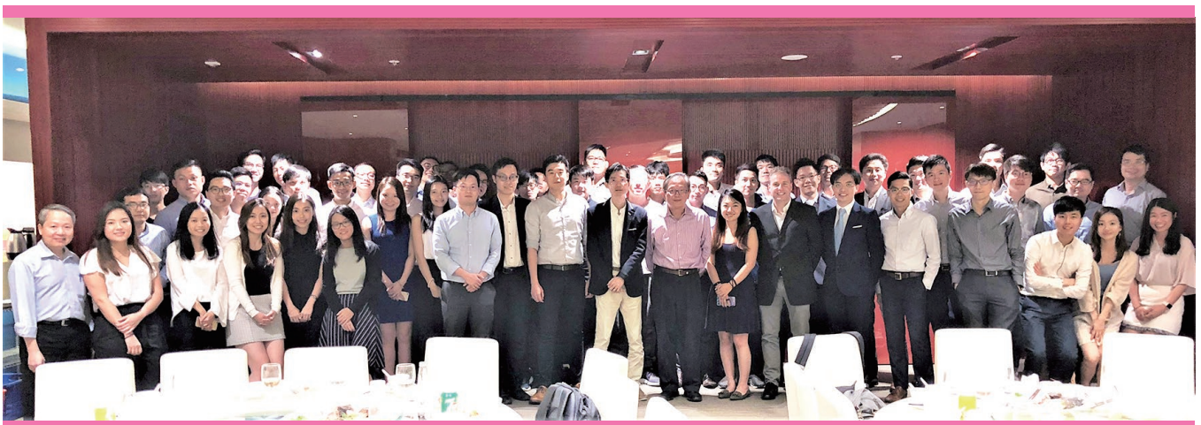
Graduation Dinner & Alumni Evening 畢業生及校友晚宴