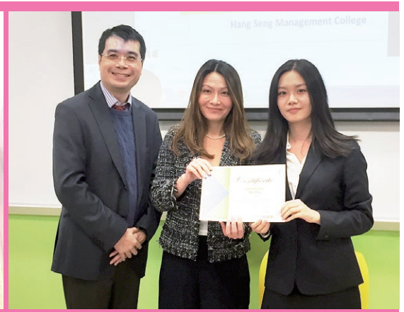
SGX Train-the-trainer Program 新加坡交易所導師訓練課程