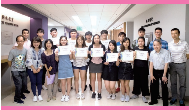
CFA Preparatory Course 特許金融分析師預備課程