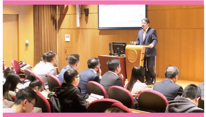
Banking and Finance Seminar Series 銀行與金融講座系列