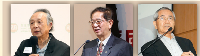
Lectures by Nobel Prize laureates at HSUHK (from left): Dr Gao Xingjian (Literature), Professor Yuan-Tseh Lee (Chemistry) and Professor Ei-ichi Negishi (Chemistry) 諾貝爾獎者在恒大主持講座（左起）： 高行健博士（文學獎）、李遠哲教授（化學獎）及根岸英一教授（化學獎）