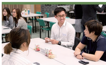
Mentorship Programme 學長計劃