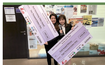
Joint University Competition (Championship of JUOMA) 校際比賽 (大學聯校市場策劃比賽金獎)