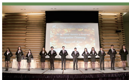
Student Association Inauguration Ceremony 學生系會就職典禮