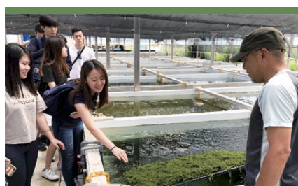
Ecological Study in Okinawa 2018 (Sea Grapes Farm) 2018 日本沖繩生態考察 (海葡萄養殖場)