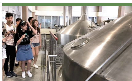
Firm Visit in Okinawa 2018 (Orion Beer Factory) 2018 日本沖繩企業參觀 (奧利恩啤酒釀製工場)