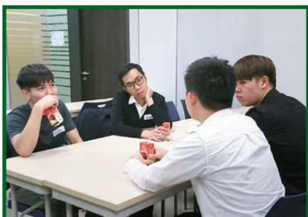
Mentorship Programme 師友計劃

答： 理賠主任的主要職責是為保險公司處理受保人的索賠，並在合約規定下計算賠償金。