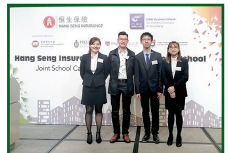
Joint-School Competition 聯校比賽