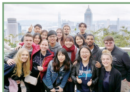
Student Exchange Programme 學生交流計劃