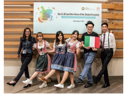
Students participated in the G-20 2017. 同學參與G-20模擬峰會2017。