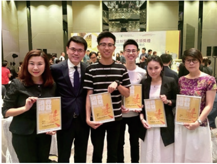
Students who were awarded in the 18th Consumer Rights Reporting Awards took photo with the Secretary for Commerce and Economic Development, Mr Edward Yau Tang Wah (2nd from left). 於第18屆消費權益新聞報道獎比賽獲獎的同學與商務及經濟發展局局長邱騰華先生(左二)合照。