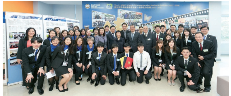
Group photo of the 1st School of Communication Student Exhibition (2017/18) 傳播學院第一屆學生作品展 (2017/18) 大合照