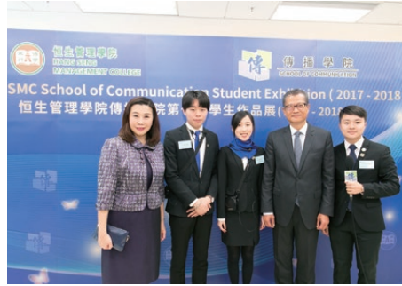
Mr Chan Mo Po (2nd from right), the Financial Secretary of HKSAR, was interviewed by BJC students in the 1st School of Communication Student Exhibition (2017/18). 陳茂波財政司司長(右二)於傳播學院第一屆學生作品展 (2017/18) 接受傳播學院的同學訪問。