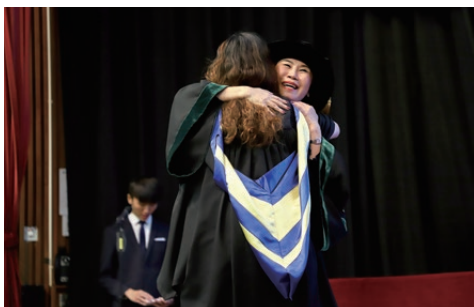
Graduates took photo with the Dean of School of Communication at the graduation ceremony. 畢業生與傳播學院院長於畢業禮合照。