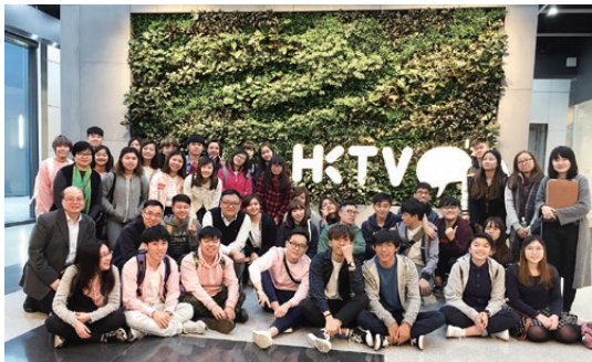
Students visited HKTVMall Media Production Centre. 學生參觀香港電視HKTVMall媒體製作中心。