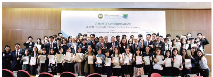
SCOM Awards Presentation Ceremony cum Rotary Club Mandarin HK Scholarship Presentation Ceremony 傳播學院舉行成績卓越頒獎典禮暨香港華語扶輪社獎學金頒獎典禮