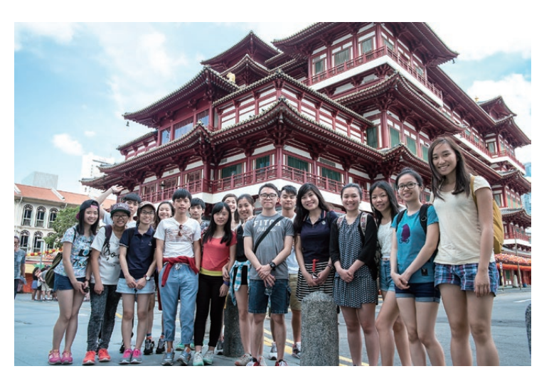
Cultural Tour to Singapore