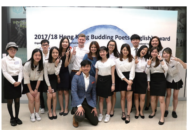
Hong Kong Budding Poets (English) Award