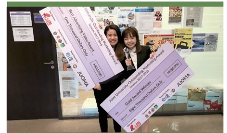
Joint University Competition (Championship of JUOMA) 校際比賽 (大學聯校市場策劃比賽金獎)