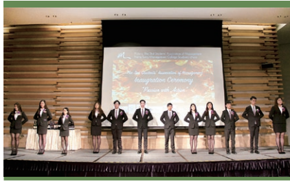
Student Association Inauguration Ceremony 學生系會就職典禮