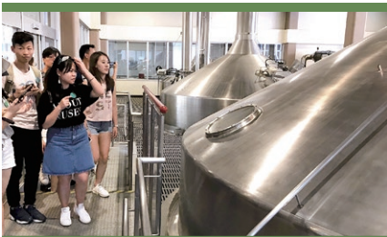
Firm Visit in Okinawa 2018 (Orion Beer Factory) 2018 日本沖繩企業參觀 (奧利恩啤酒釀製工場)