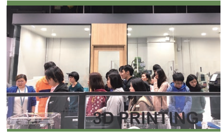
Workshop (3D Printing) 工作坊 (3D 打印)