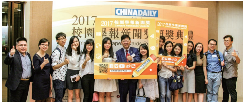
Students were awarded in the Campus Newspaper Competition. 同學於校園學報比賽獲得多個大獎。