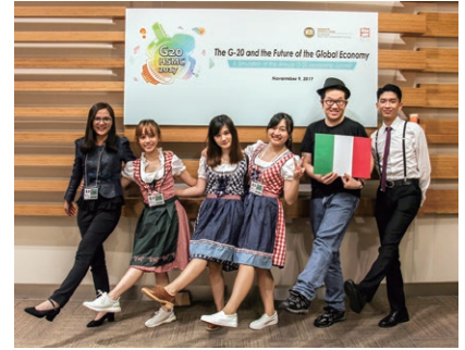
Students participated in the HSMC G-20 2017. 同學參與恒管G-20模擬峯會2017。