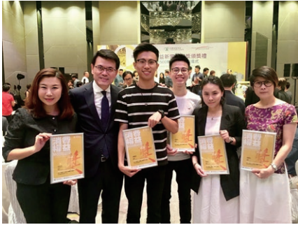
Students who were awarded in the 18th Consumer Rights Reporting Awards took photo with the Secretary for Commerce and Economic Development, Mr Edward Yau Tang Wah (2nd from left). 於第18屆消費權益新聞報道獎比賽獲獎的同學與商務及經濟發展局局長邱騰華先生(左二)合照。