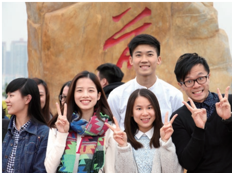
SCOM staff and students visited Qianhai. 傳播學院師生到訪前海。