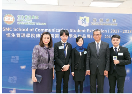
Mr Chan Mo Po (2nd from right), the Financial Secretary of HKSAR, was interviewed by BJC students in the 1st HSMC School of Communication Student Exhibition (2017/18). 陳茂波財政司司長(右二)於恒生管理學院傳播學院第一屆學生作品展(2017/18)接受傳播學院的同學訪問。