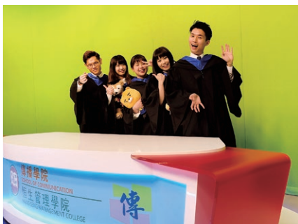
Students took photos at the Student's Photo Day. 學生於畢業前留影。