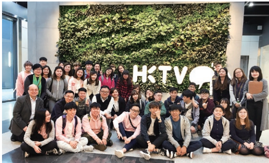
Students visited HKTVMall Media Production Centre. 學生參觀香港電視HKTVMall媒體製作中心。