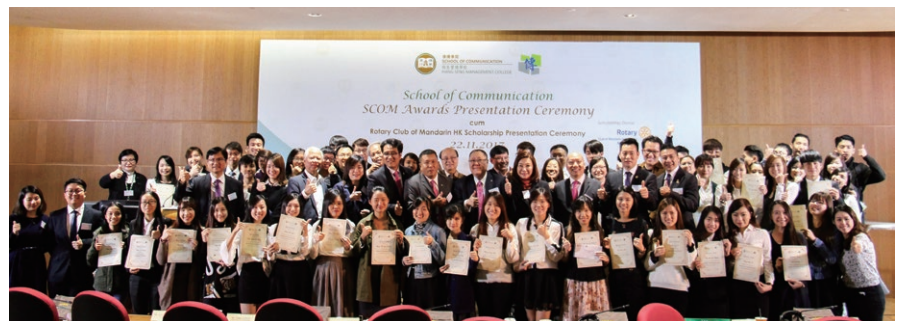
SCOM Awards Presentation Ceremony cum Rotary Club Mandarin HK Scholarship Presentation Ceremony 傳播學院舉行成績卓越頒獎典禮暨香港華語扶輪社獎學金頒獎典禮