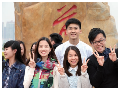
SCOM staff and students visited Qianhai. 傳播學院師生到訪前海。