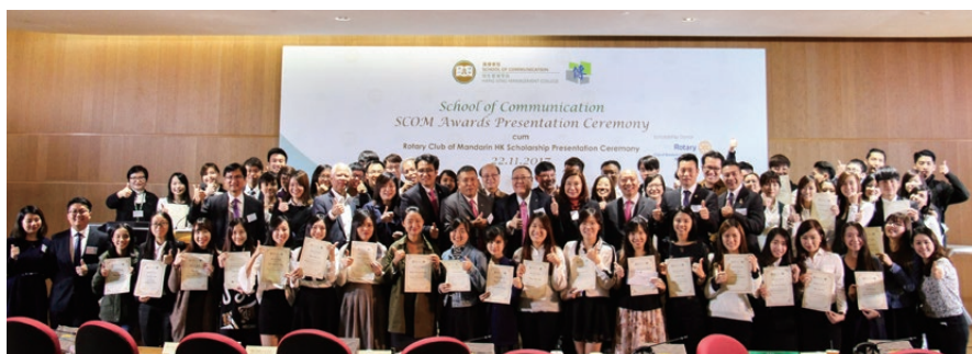
SCOM Awards Presentation Ceremony cum Rotary Club Mandarin HK Scholarship Presentation Ceremony 傳播學院舉行成績卓越頒獎典禮暨香港華語扶輪社獎學金頒獎典禮