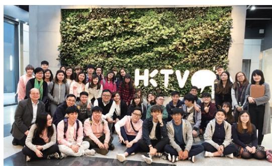
Students visited HKTVMall Media Production Centre. 學生參觀香港電視HKTVMall媒體製作中心。