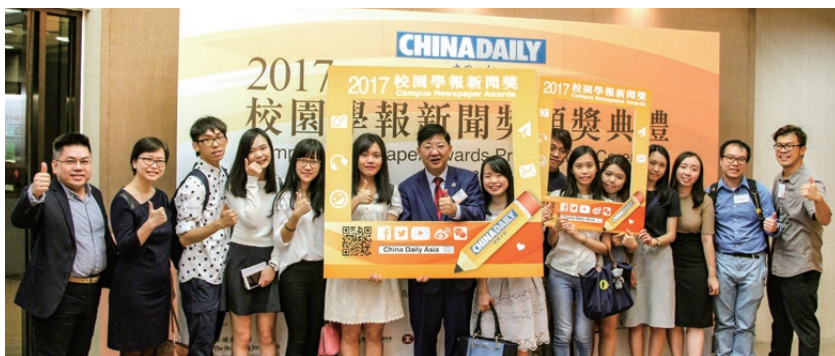
Students were awarded in the Campus Newspaper Competition. 同學於校園學報比賽獲得多個大獎。