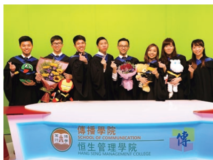
Students took photos at the Graduation Ceremony. 同學於畢業典禮當日留影。