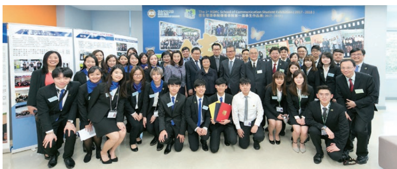
Group photo of the 1st HSMC School of Communication Student Exhibition (2017/18) 恒生管理學院傳播學院第一屆學生作品展(2017/18)大合照