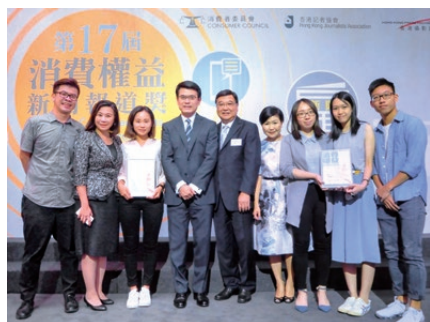
Students who were awarded in the 17th Consumer Rights Reporting Awards took photo with the Secretary for Commerce and Economic Development, Mr Edward Yau Tang Wah (4th from left).

於第17屆消費權益新聞報道獎比賽獲獎的同學與商務及經濟發展局局長邱騰華先生(左四)合照。