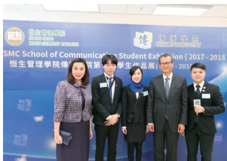
Mr Chan Mo Po, the Financial Secretary of HKSAR, was interviewed by BJC students in the 1st HSMC School of Communication Student Exhibition (2017-2018). 陳茂波財政司司長於恒生管理學院傳播學院第一屆學生作品展(2017/18)接受傳播學院的同學訪問。

於第17屆消費權益新聞報道獎比賽獲獎的同學與商務及經濟發展局局長邱騰華先生(左四)合照。