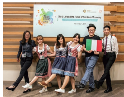
Students participated in the HSMC G-20 2017. 同學參與恒管G-20模擬峰會2017。