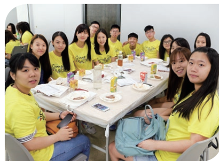
College Orientation Day 迎新日