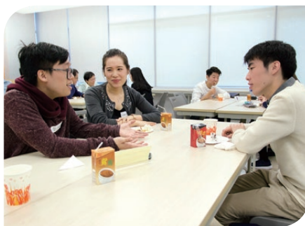
Executive Mentorship Programme 專業導師計劃