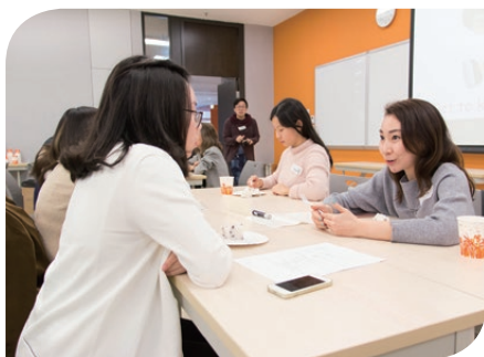
Elite Network Mentorship Scheme 精英網絡學長計劃