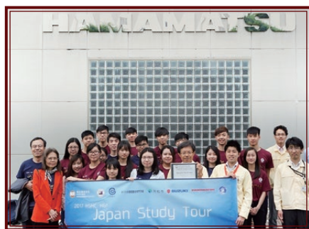
Japan Study Tour 日本遊學團