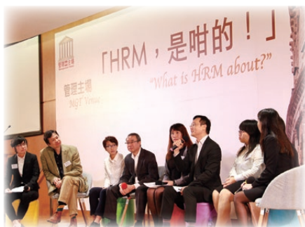
Management Venue 管理主場