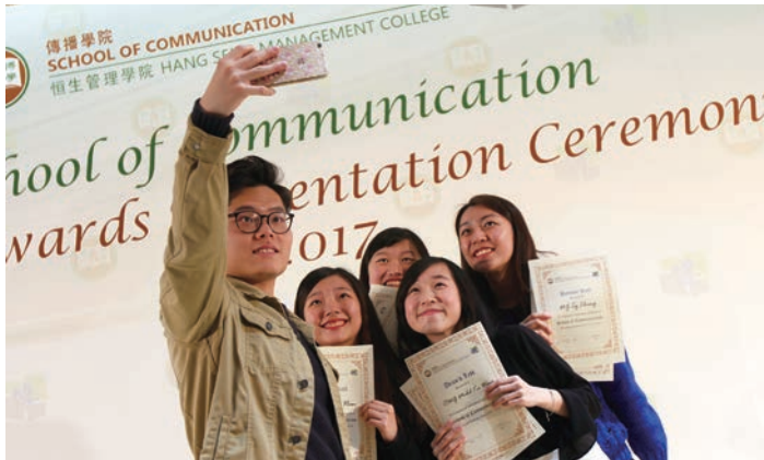
Awardees took photos in SCOM Awards Presentation Ceremony. 得獎同學於傳播學院頒獎典禮興奮拍照留念。