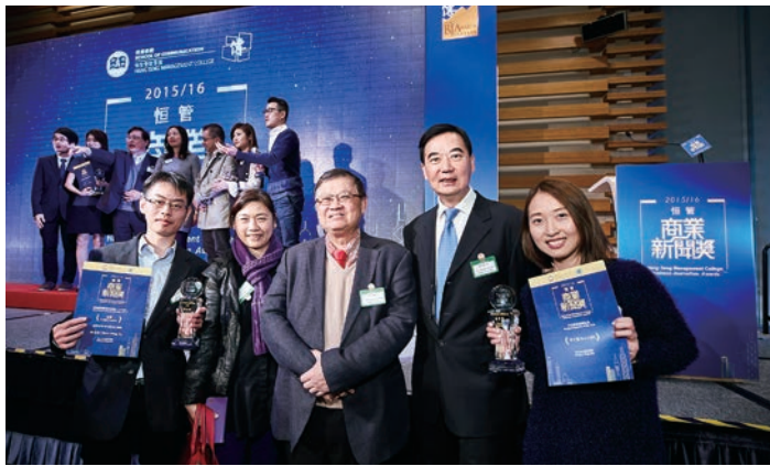
HSMC Business Journalism Awards 2015/16 Presentation Ceremony 2015/16 恒管商業新聞獎頒獎典禮