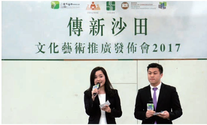
Students being MCs in Shatin Arts and Cultural Project 2017. 同學於「傳新沙田」文化藝術推廣發佈會2017 擔任司儀。