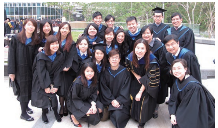
Graduation Photo Day 畢業禮照相日