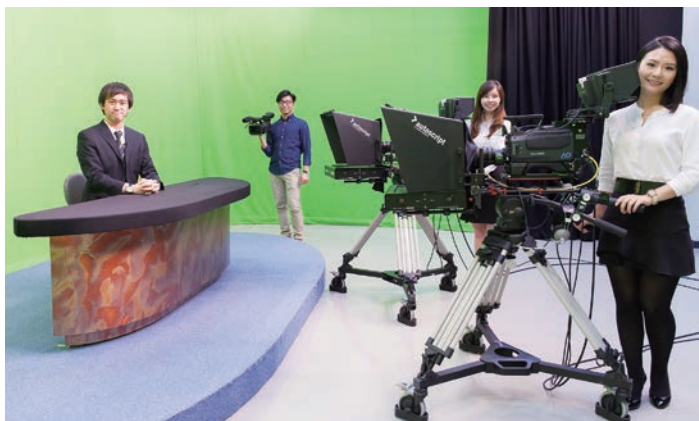
SCOM TV Studio SCOM 電視錄影廠