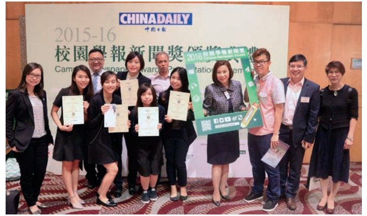
SCOM students were awarded in Campus Newspaper Competition 2015/16. 傳播學院同學於2015/16 校園學報比賽得獎。