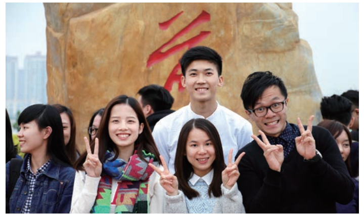
SCOM staff and students visited Qianhai. 傳播學院師生到訪前海。