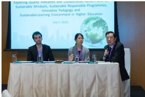
Panel Session 3