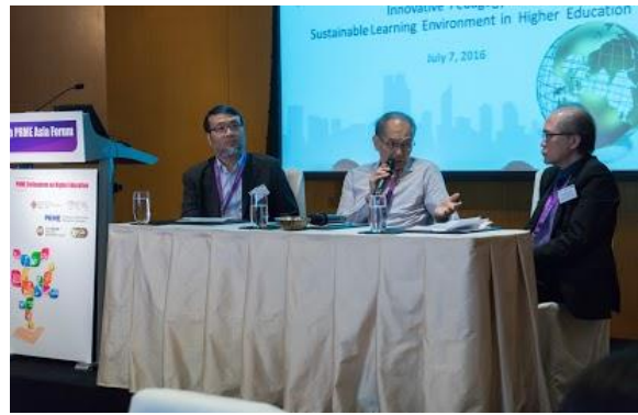
Panel Session 2