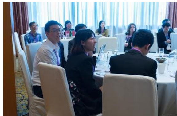
A scene at UN PRME Colloquium 2016