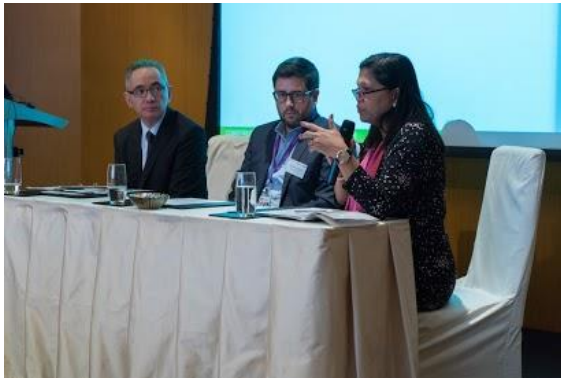
Panel Session 1