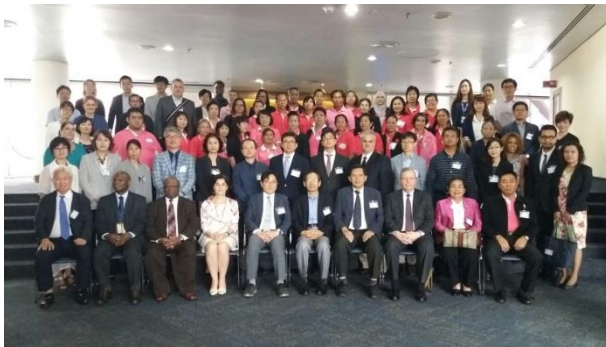
Facility / Programme for Capacity Development for Poverty Reduction through South-South and Triangular Cooperation