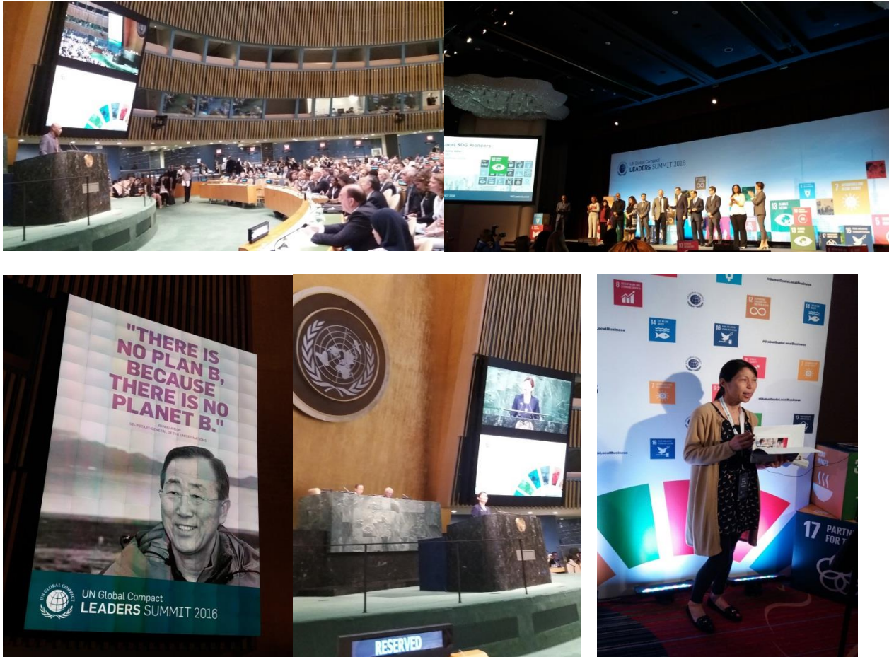
Scenes of UN Global Compact Leaders Summit 2016