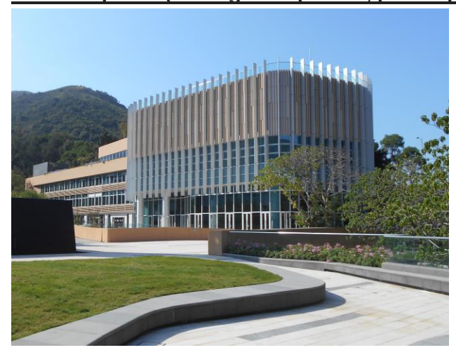
HSMC Sports and Amenities Centre