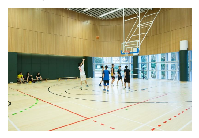
Bamboo Floors in the Sports Hall