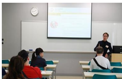
Information session of the programme