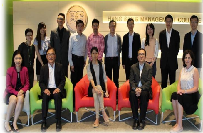
A group photo of the Department of Supply Chain Management