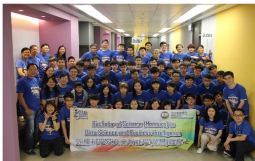
A group photo of the BSc-DSBI students