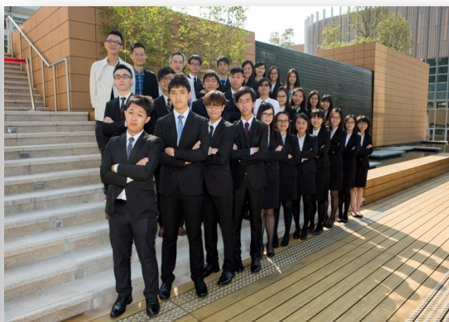
Group photo of 2014/15 Student Representatives and Department Representatives of SCM Department