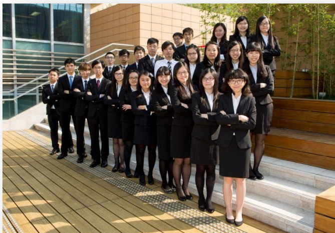
Group photo of 2014/15 Student Representatives of SCM Department

A group of student representatives was nominated by the Department of Supply Chain Management for the academic year 2014/15. Their major duty is to liaise with inbound/outbound school seminars and their secondary schools. The representative will be invited to share their learning experience and engagement in school activities at HSMC to high-school students. In addition, they will also be invited to participate in media interviews, establishing a positive image for our department.