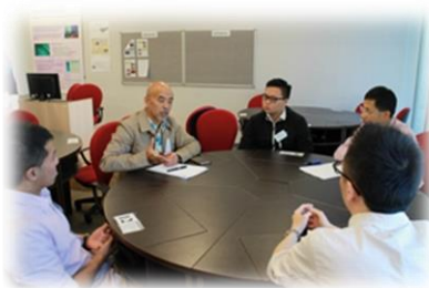
Mentor-mentees group meeting