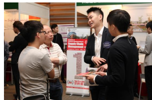
HSMC Information Day: BBA-SCM & BMSIM