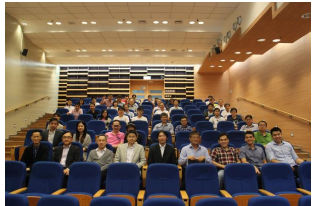
Guest speakers and SCM colleagues took a group photo with the participants