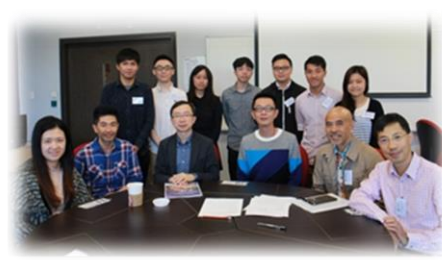
Group Photo of mentors and mentees