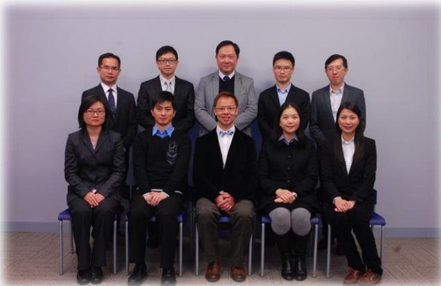
A group photo of the Department of Mathematics & Statistics