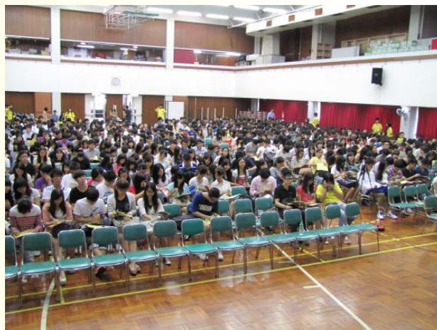
The BBA freshmen listened attentively to the introduction of BBA Programme.