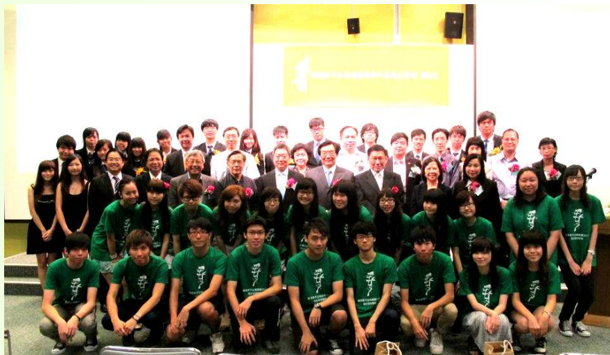
Launching Ceremony of “Hong Kong Junzi Corporation Survey 2012”

The “Hong Kong Junzi Corporation Survey” is the signature event of the Marketing Society of HSMC. The survey investigates how consumers in Hong Kong evaluate corporations from a Confucian's perspective. This year's cabinet, Skyline, has decided to continue this meaningful tradition. It is hoped that this event can raise the standards of corporate social responsibility, and the Confucian perspective may shed light on how corporate social responsibility can be assessed.