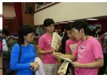
Committee members of Student Association of Business Administration addressed enquiries from guests.