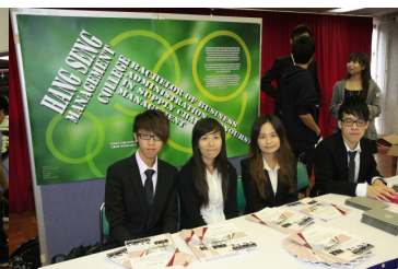
Student helpers of BBA-SCM Programme received guests at the enquiry counter.