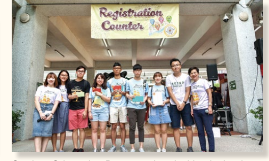
Student Orientation Day completed with a lucky draw. 大抽獎是迎新日壓軸節目。