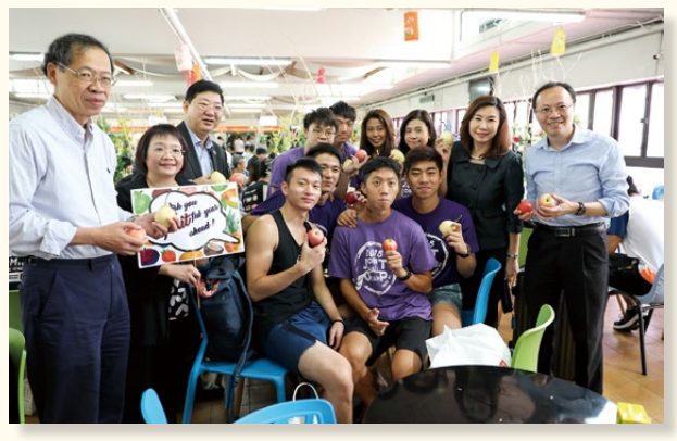
HSMC senior management wished the students a fruitful new academic year. 恒管管理層祝願學生在新學年成果豐碩。