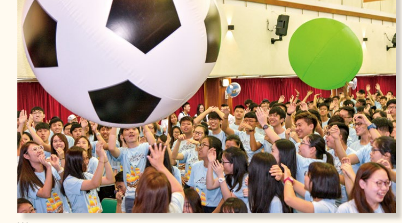
Warm-up game 熱身遊戲

恒生管理學院迎新日於2018年8月21日舉行,以 「Student Learning FIRST」為主題。超過 1,300 位新 生、高年級學生及教職員一起參與多采多姿的迎新活 動!新生也透過不同活動獲得有用資訊,在恒管開展 校園生活新一頁!