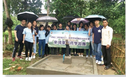
Overseas Service-learning Trip to Cambodia 柬埔寨服務學習之旅

培訓計劃方面,「香港・台灣服務學習交流團」成員包括 15 名恒管學生和 15 名台灣亞洲大學學生。他們合作設計行程及服務內容,於 2018 年7月2日至14日期間,在香港及台灣以基層人士為對象,提供服務。兩地學生於分享環節交換心得,就服務內容作出檢討。