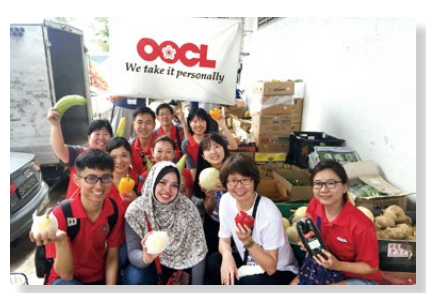
HSMC intern (1st right, 2nd row) at OOCL, Singapore 恒管學生 (第二排右一) 在新加坡東方海外貨櫃航運公司實習。