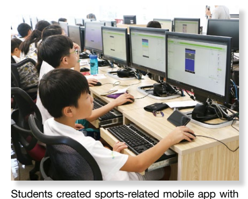
the help of coding tutors.