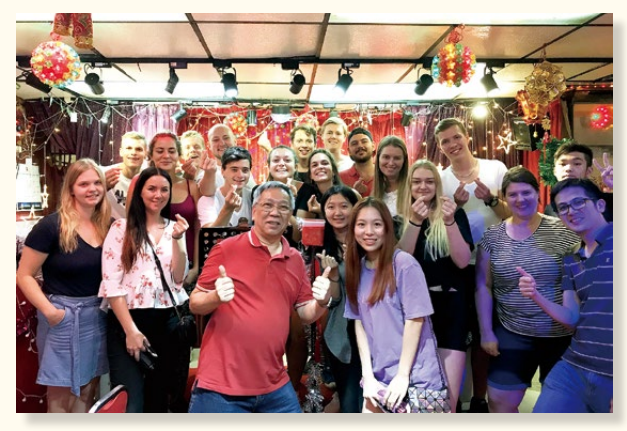
Enjoyed fun-filled atmosphere in a singing parlour 感受本地歌廳的熱鬧氣氛。