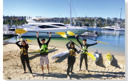
HSMC intern (1st from right) at Sydney Harbour Kayaks, Australia 恒管學生(右一)在澳洲 Sydney Harbour Kayaks 實習。