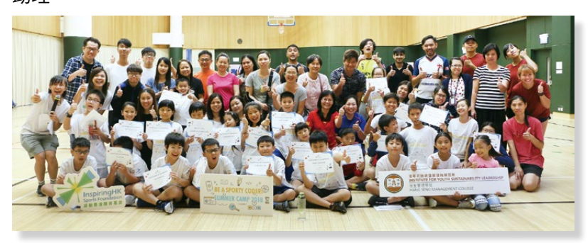
Closing ceremony of the summer camp 暑期營閉幕禮

恒管的青年可持續發展領袖研習所、慈善組織凝動香港體育基金以 及兒童編碼學院朗琦科技教育攜手合作,於2018年8月6日至10 日舉行「好動編碼員暑期營 2018」。暑期營為期五天,為約 50 名 高小學生提供運動訓練和編碼課程。恒管的學生事務處體育組和 資訊科技服務中心為暑期營提供各項設備,而恒管學生也擔當學生 助理。