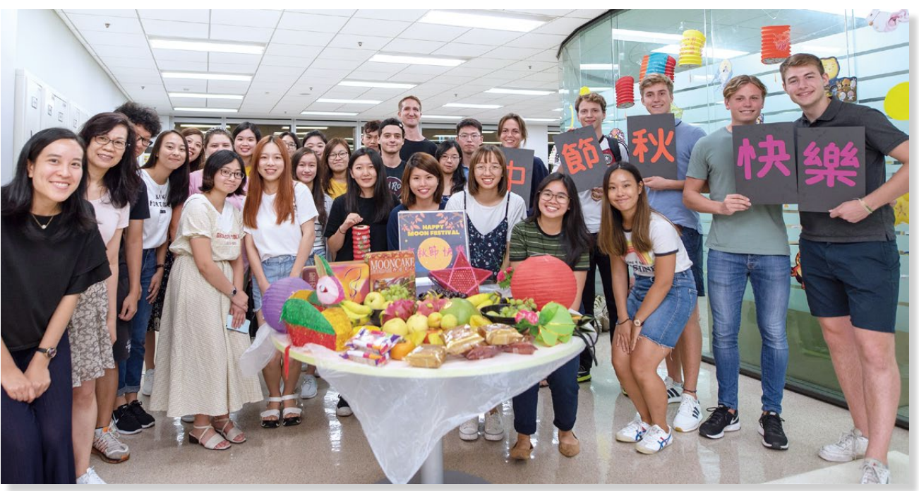
Mid-Autumn Festival activity co-organised by SAO and Library. 學生事務處與圖書館合辦慶中秋活動。