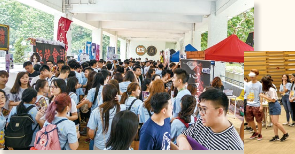
New students visited the booths arranged by student organisations. 新生參觀由學生組織安排的攤位。